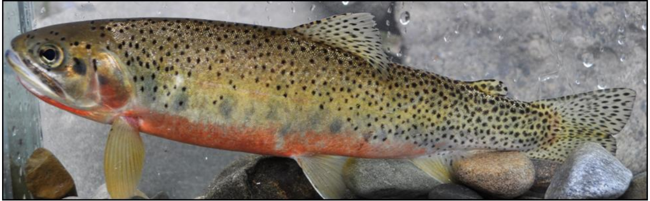
Figure 1. Westslope cutthroat trout