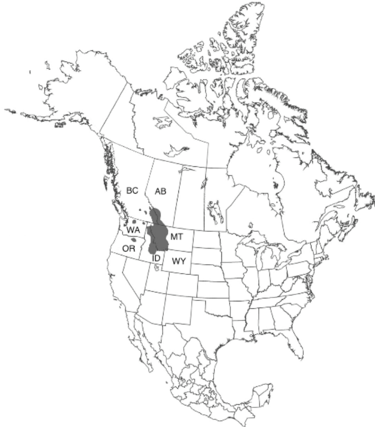
Figure 2. Original global distribution of westslope cutthroat trout (shaded). Figure modified from AESRD and ACA (2006). Distribution data primarily from Behnke (1992) (see text).

Oldman River drainages (McIllrie and White-Fraser 1983 (re 1890); Sisley 1911; Prince et al. 1912; Nelson and Paetz 1992).