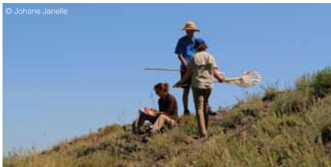
Volunteers in action