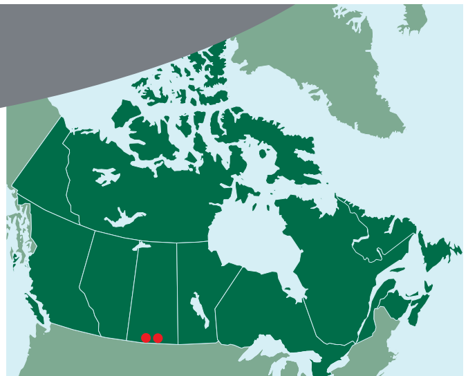
Grasslands National Park of Canada