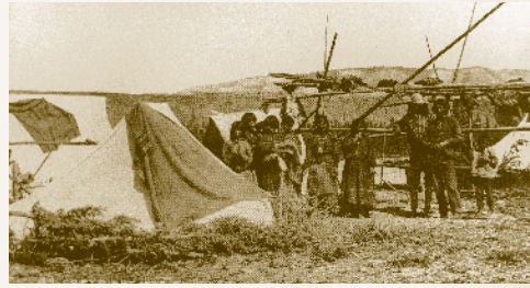
Group of Pelly Indians at Fort Selkirk, 1894.

Northern Tutchone people of the lower Pelly region stopped here during their seasonal round. Following