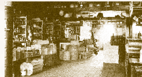
The interior of the Schofield and Zimmerlee store.

The Chilkats, a Tlingit tribe from the coast, were trading partners and frequent visitors to Fort Selkirk.