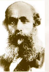
Robert Campbell