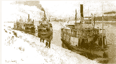
Sternwheelers Tyrrell, Dawson, Selkirk & Whitehorse docked at Fort Selkirk, 1903.