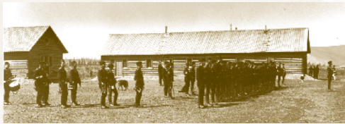
Yukon Field Force at Fort Selkirk in 1898. Buildings in background are L-R: Dining Mess, Sergeant's Mess & Quarter Master Stores.

parade square. The Canadian government sent the Force north to keep order during the Klondike Gold Rush and ensure that the large number of Americans flocking to the gold fields did not threaten Canadian control of the area. The Force did not stay long; during the spring following their arrival at Fort Selkirk, 200 soldiers were dispersed to Dawson City or sent south.