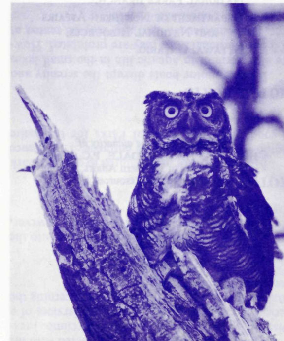
A night-hunting Great-horned owl rests during daylight.

Fire in a National Park can cause damage which cannot be repaired in a hundred years.