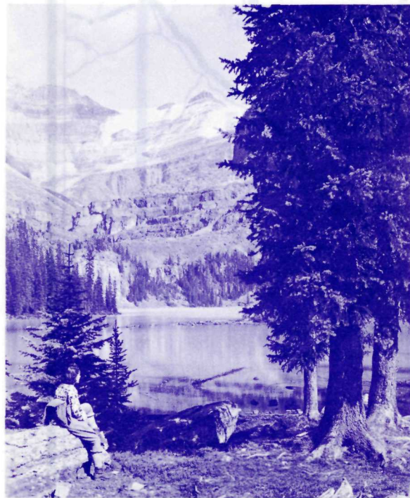
Many evergreens thrive in this montane zone and some survive up to timber-line.

The herbaceous plants or wildflowers include the attractive glacier lily, the wild onion with its