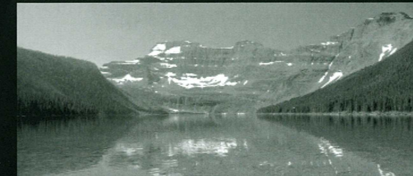
Cameron Lake spans the Canadian/United States border.

Wildlife may not understand the concept of peace, but it benefits them all the same. Working together the parks and their neighbors can preserve a habitat large enough for the survival of animals such as the mountain goat, wolf, and grizzly bear.