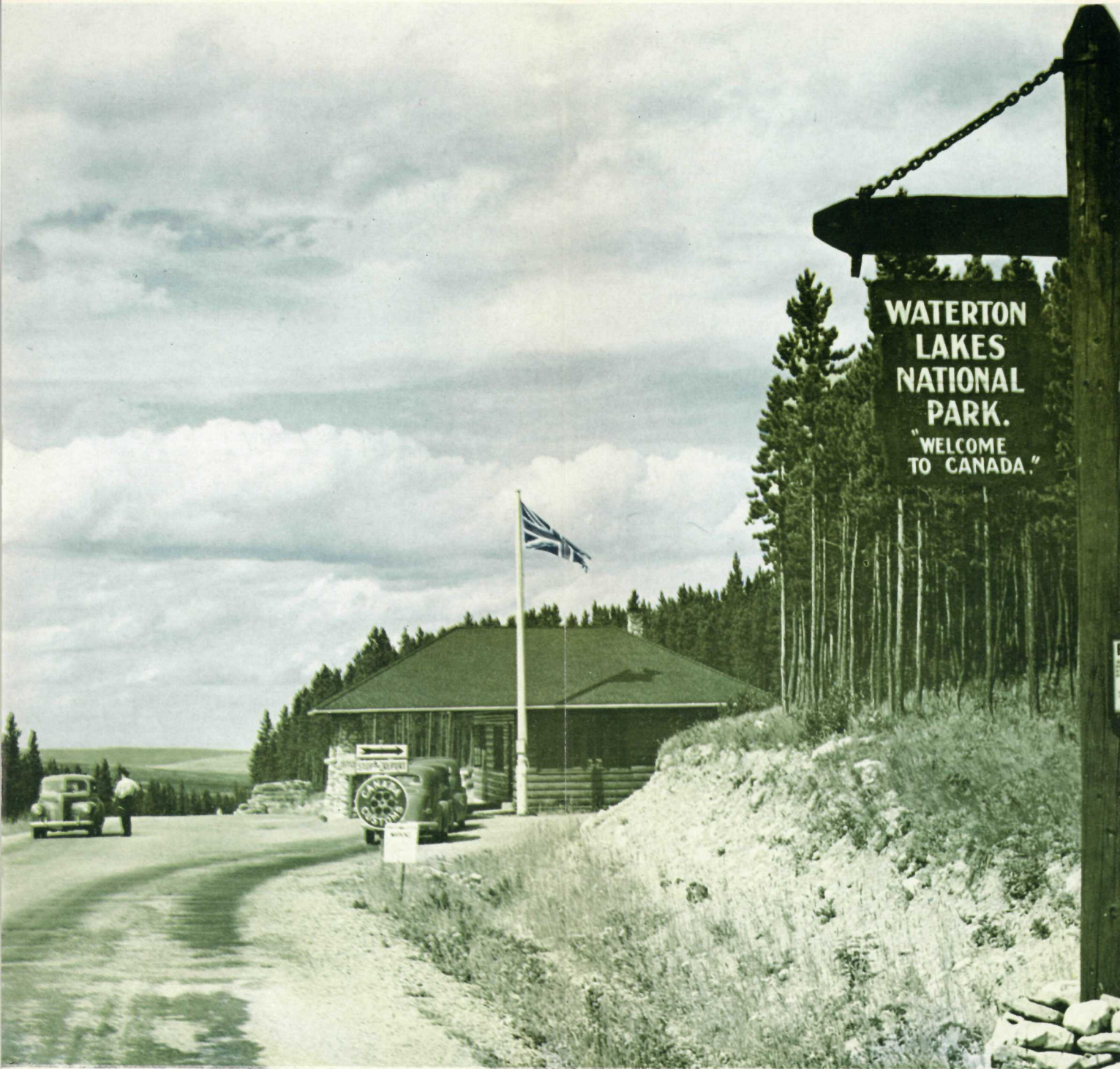
Entering Canada by the Chief Mountain International Highway from Glacier National Park, Montana.