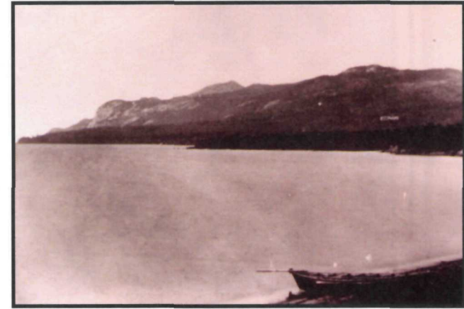
A view from near the Historic Site.