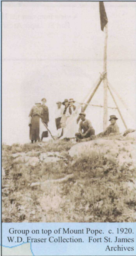
Group on top of Mount Pope. c. 1920.

Distance from Fort St. James National Historic Site to the Nak'al Trailhead is 6.2km