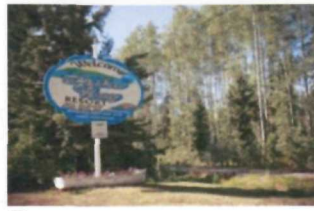
Pitka Bay Resort