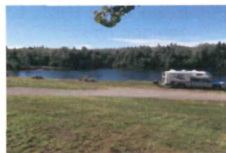
Stuart Lake Campground