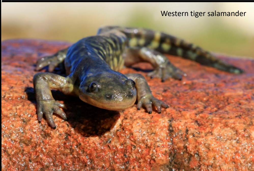
Western tiger salamander

The creation of a new national park reserve is a complex process. The parties will take appropriate consideration and time.