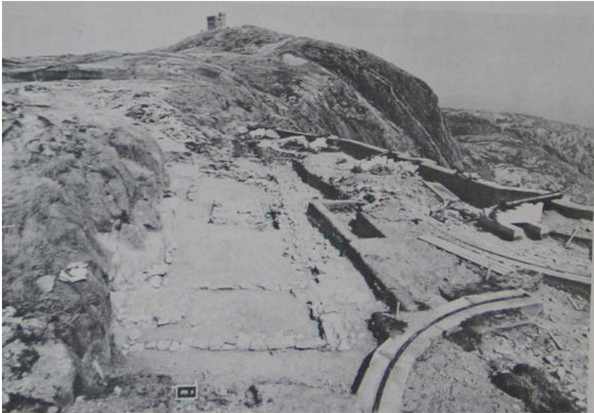
Figure 11 Foundations exposed at the Queen's Battery in 1966 (From Jelks 1973) (Mills)