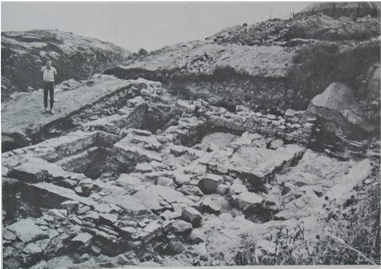
Figure 10 Archaeologist Edward Jelks standing by the excavated ruins of the 1835 canteen at Ladies Lookout in 1966. (From Jelks 1973) (Mills)