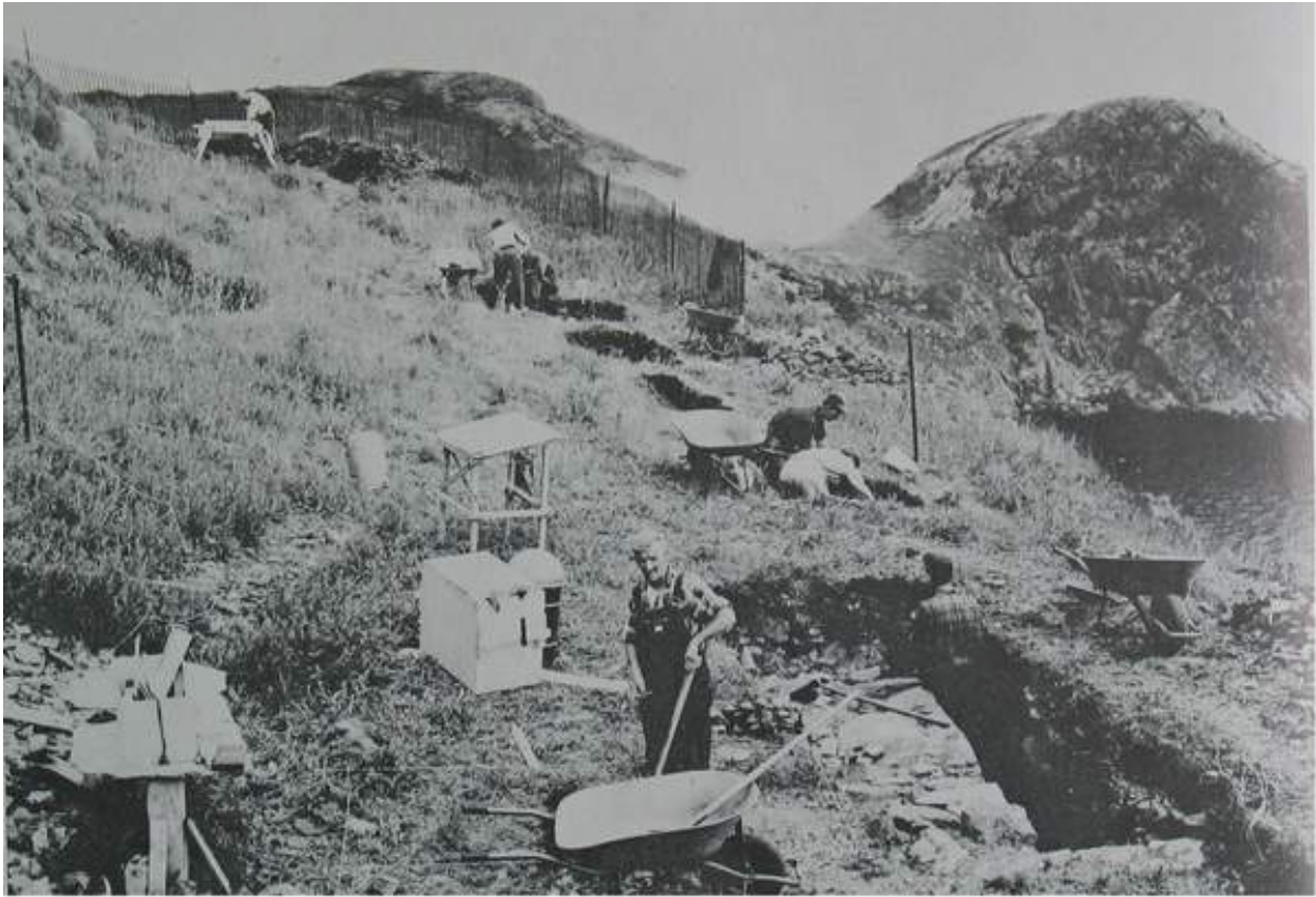
Figure 9 Workers excavating at Ladies Lookout in 1966 (From Jelks 1973) (Mills)