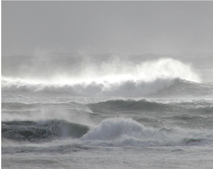
Hurricane surf conditions at Sable Island pose serious risks

Located in the North Atlantic, Sable Island can be subject to severe weather conditions. It is advised to bring a variety of clothing and equipment to be prepared for various weather conditions.