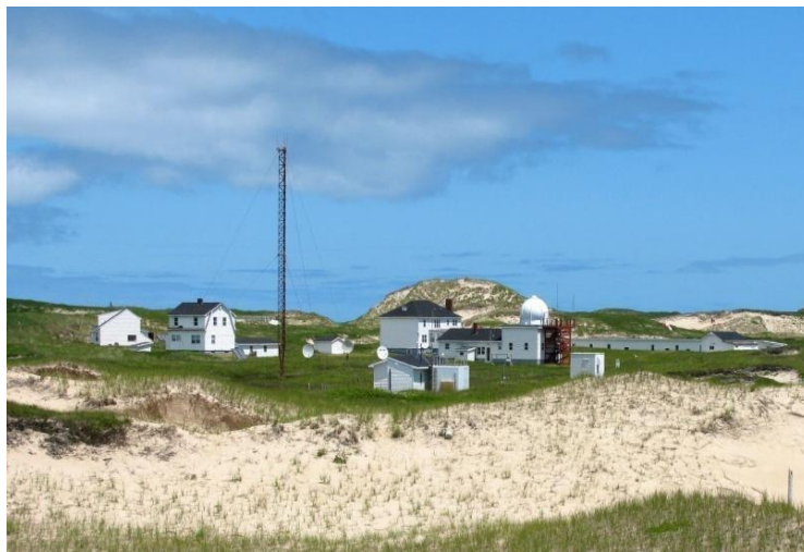
Main Station has, among other infrastructure, weather monitoring equipment, staff accommodations, workshops, emergency supplies, power generation, water treatment, and communications equipment.