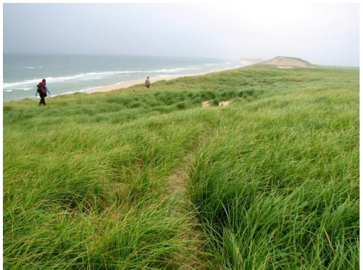
Hikers using existing horse paths through dune grass

The hard-packed sand of the beaches is the easiest and best place to travel.