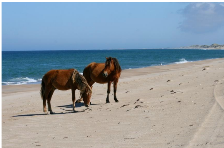
Horses supplement their diet with kelp and seaweed on the beach

Be aware that walking on sand for prolonged periods can be more difficult than equivalent distances on hard surfaces or solid terrain. The sandy terrain and wilderness setting can prove challenging to some people. Please be aware of these accessibility issues when planning your visit. Keep in mind that Parks Canada staff will transport you and your gear from the south beach landing area to Main Station if you are arriving by plane.