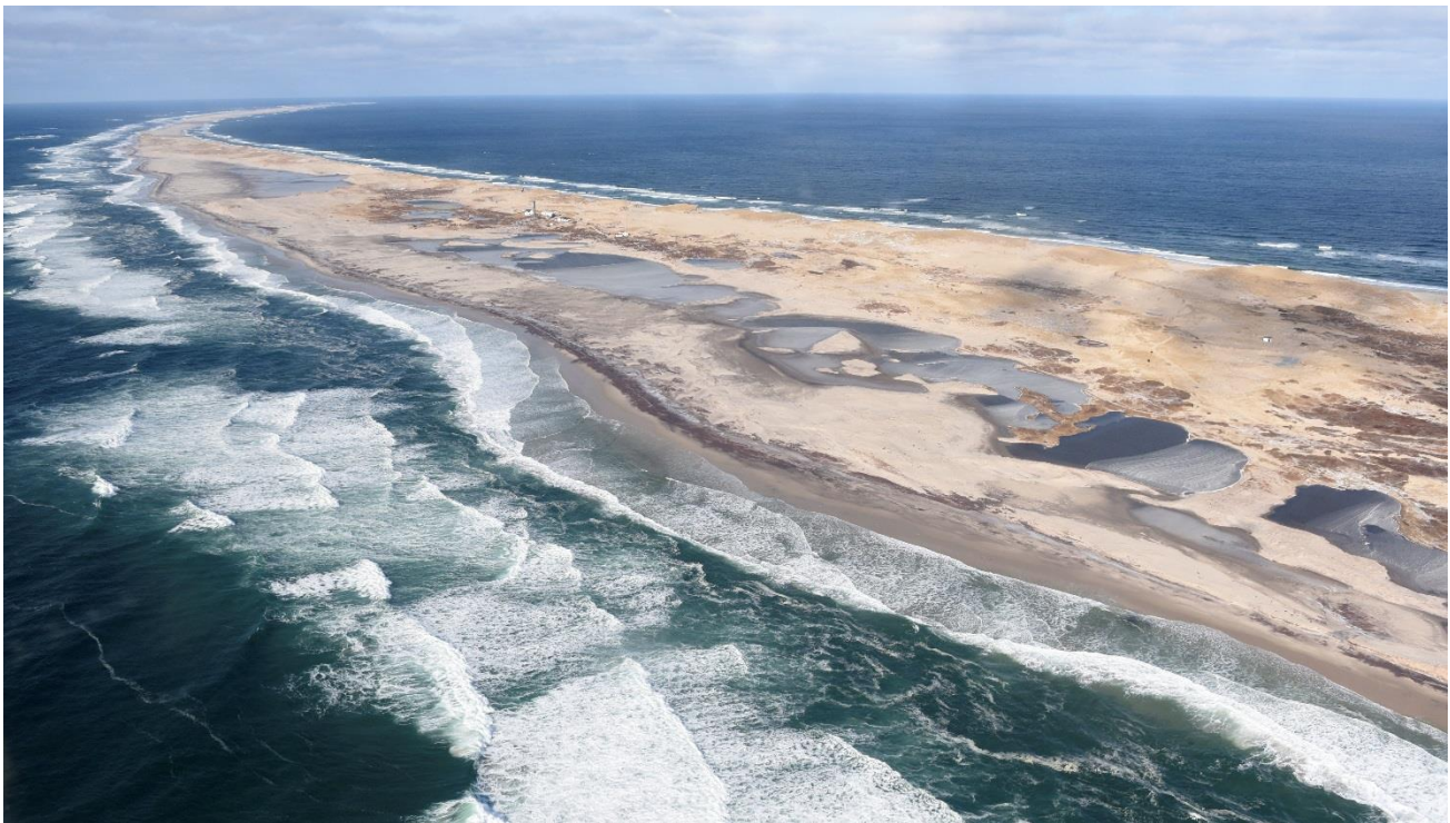
Aerial view of Sable Island.

For more information about the natural and cultural history of Sable Island, or the establishment and management of the national park reserve, please go to the Parks Canada website at www.pc.gc.ca/sable .