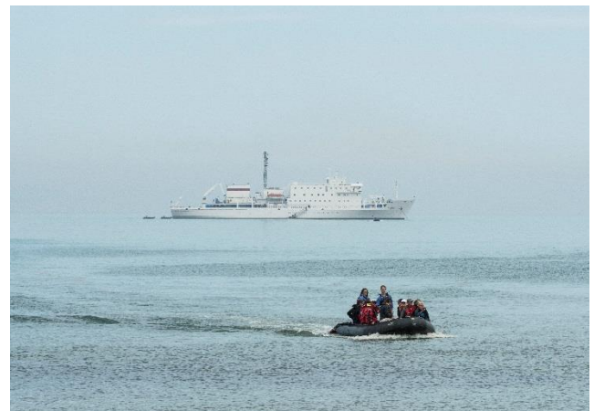
A zodiac after transferring passengers from a ship anchored offshore.

• Visitors must not attempt to land on the beach until Parks Canada personnel are in position to monitor their arrival, provide transportation to Main Station if required, and to provide an orientation and safety briefing to Sable Island.