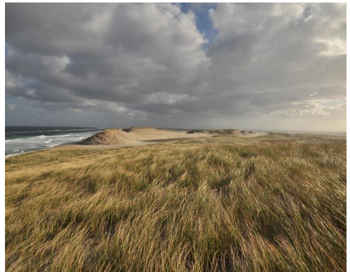
Stormy skies.

conditions to depart. Both situations affect travel itineraries and impact accommodations costs. If a delay persists when a visitor is on the island, emergency accommodations and provisions may be available. There are fees for these services.