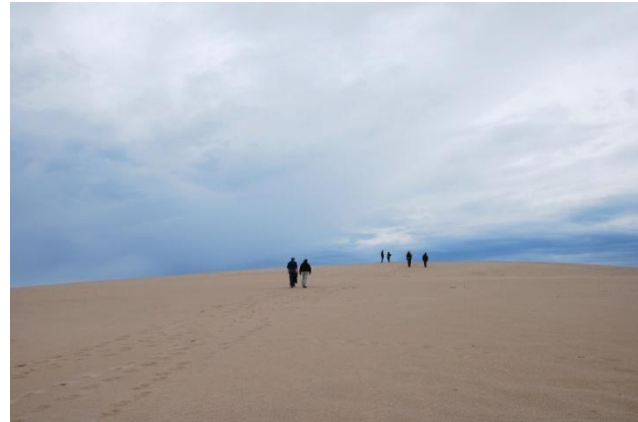
Hiking up Bald Dune