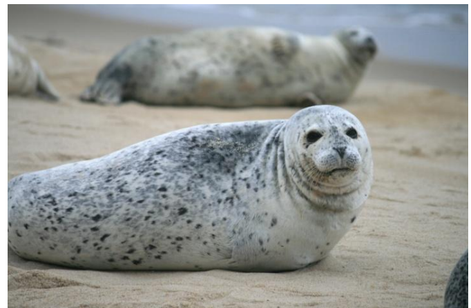
Harbour seals basking on north beach

Grey seals are the most common large animal on the island, with large breeding colonies throughout the island for the pupping season of December and January. Up to 50,000 pups can be born in a given year. During the summer, their numbers are reduced but they are still common. Harbour seals are also year-round residents but are less numerous than Grey seals. They breed in May and June. This population is in decline and it is important to avoid disturbing them, either on vehicles or on foot. Seals can bite! Keep your distance and avoid getting in their way.