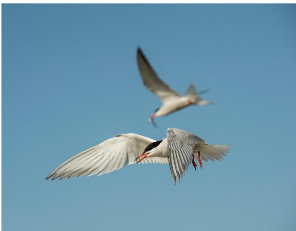
Terns flying above the beach.