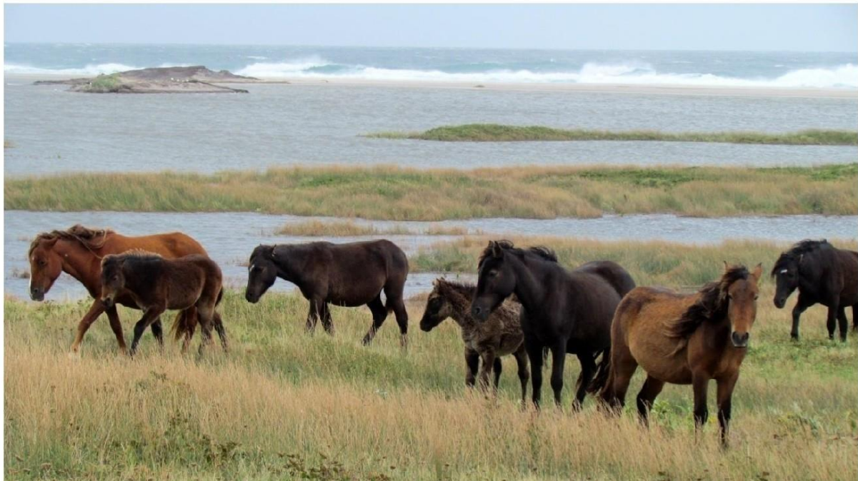
A family band of wild horses walks near West Light. The Sable Island horse population has historically ranged between 150 and 450 individuals.