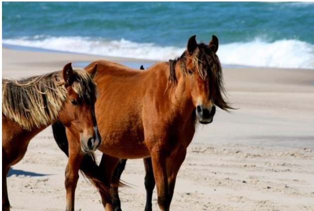
Horses must be respected as wild animals

The wild horses are Sable Island National Park Reserve's most famous feature. It is important to remember that the horses are wild animals and must not be harassed, interfered with, or fed. If you are approached by the horses, please back away and remove yourself and maintain a respectful distance from the horses (20 metres) so as not to interfere with their behaviour. Do not approach young foals. There have been a number of instances where people have been injured by horses. In all cases, humans were agitating the horses, trying to feed them, trying to pet them, or interfering in herd movements. Please be careful!