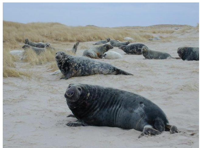
Grey seals can be aggressive if agitated

For information on the hazards posed by wildlife, please see the Protecting Sable Island section.