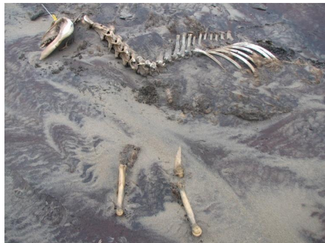
Horse skeletons are subjects of research on Sable Island

Similarly, if you find any archaeological or cultural artefacts or remains, please advise Parks Canada staff at Main Station of your discovery.