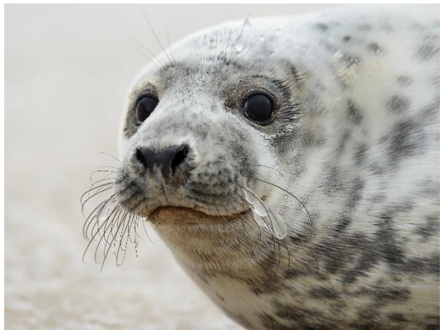
A harbour seal pup appears to be smiling.