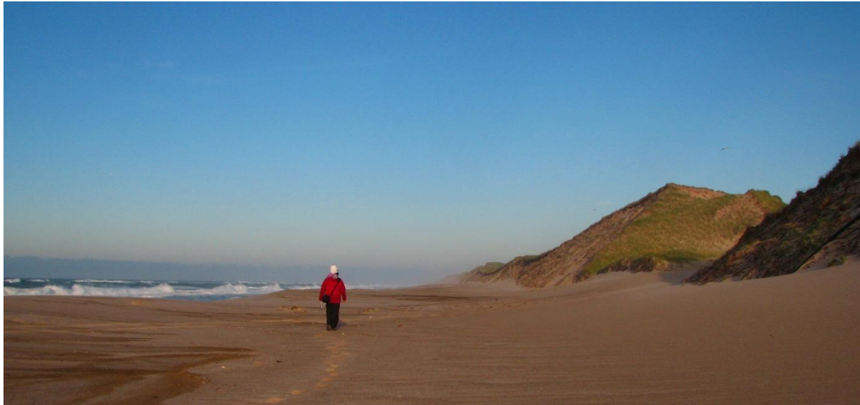
A hiker walks by the dunes flanking north beach. The high dunes of Sable Island are one of Eastern Canada's largest dune systems.

A well-organized day trip offers visitors the opportunity to experience many of the most compelling aspects of Sable Island National Park Reserve. The area around Main Station has many iconic features within walking distance. You can explore rolling windswept dunes, walk along beaches on both the north and south sides of the island, see wild horses, seals, birds, freshwater ponds, remnants of the island's history, and experience the isolated nature of being on a remote island in the midst of the North Atlantic.