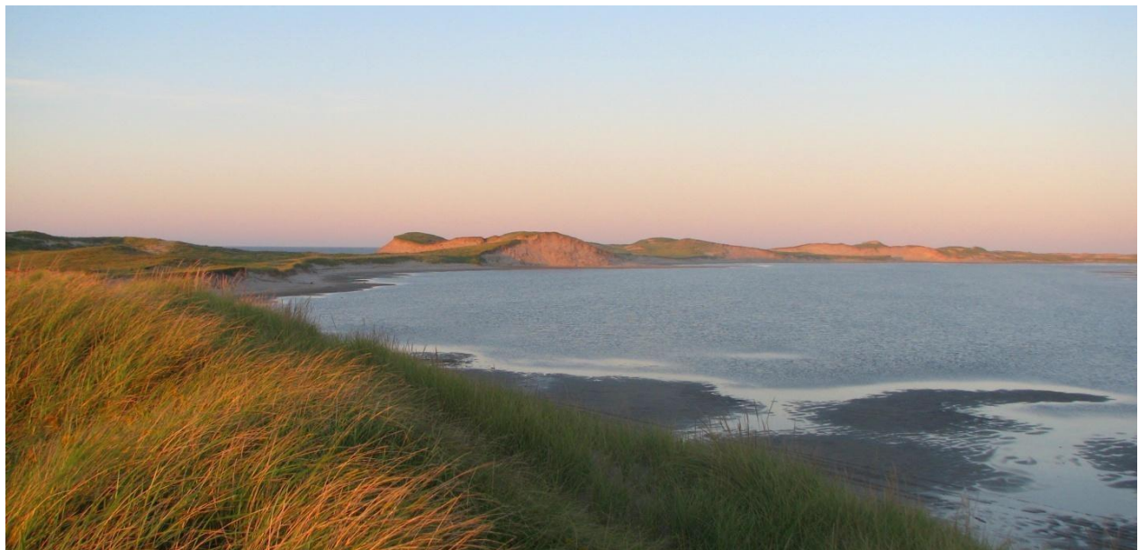
Evening light on south beach dunes