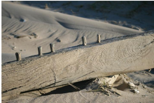
Wooden part of an old shipwreck

In a national park, it is illegal to collect rocks, shells, animal specimens, plants, or cultural artefacts. Over time, removal of plants, shells, or other natural elements can have negative effects on the ecosystem of Sable Island. Sable Island has a rich history, with over 350 recorded ship wrecks since 1583 and continuous human habitation since 1801. Visitors will occasionally find artefacts from shipwrecks or old settlements on the island. We encourage you to photograph your findings, and report discoveries to Parks Canada personnel at Main Station. Removal of any artefacts is not permitted.