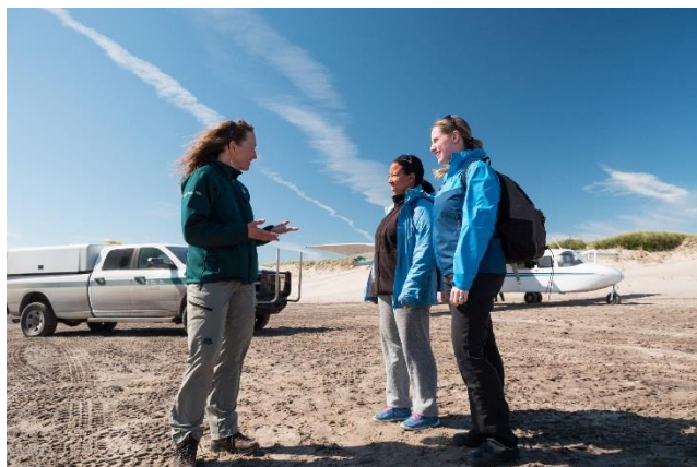
Island personnel greet visitors beside a plane on the sand runway of south beach.

Air charter is the most common way to get to Sable Island, since most people only make day trips. Sable Aviation 44 60 Inc. is the provider of this service to Sable Island, with a 7-passenger Britten- Norman Islander plane. Based on normal wind conditions, the flight from the Halifax Stanfield International Airport to Sable Island is about one hour and fifteen minutes; the return is approximately one hour forty minutes.