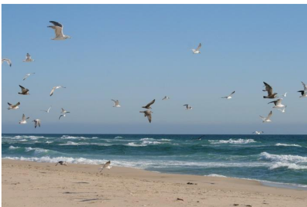
Gulls flying over West Spit. Gulls and terns will aggressively defend their nests

There have been more than 350 species of birds recorded on Sable Island, with sixteen species breeding in the island's various habitats. During spring and summer, care must be taken to avoid disturbing ducks, shorebirds, and sparrows nesting in the areas of heath and pond-edge vegetation. Tern colonies should be avoided on the dunes or on the open beaches during April through July. Both terns and gulls will aggressively defend their nests, and can injure humans. If you find yourself 'under attack' turn and leave the area immediately.