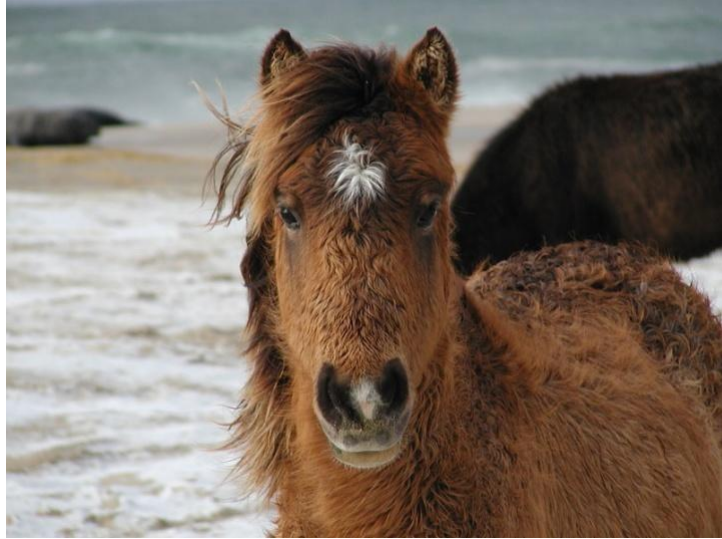
Young horse on beach in winter

Sable Island National Park Reserve Parks Canada 1869 Upper Water Street Suite AH 201 Halifax, Nova Scotia B3J 1S9 Phone: 1 902-426-1500 Fax: 1 902-426-4228 Email: pc.sable.pc@canada.ca