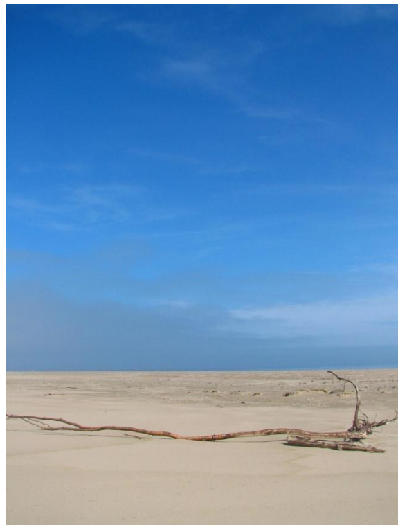
Driftwood washed up on the expansive East Spit sand flats

It is important to note that there is no cell phone coverage on Sable Island. In case of an emergency, phone calls can be made from Main Station to the Mainland via satellite phone. When hiking around Sable Island it is recommended that visitors carry their own marine radios or satellite phones.