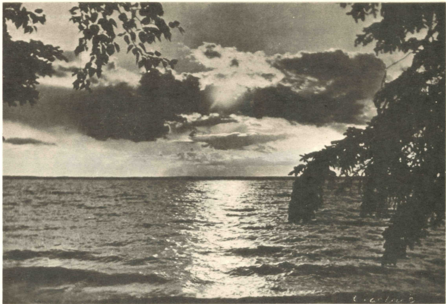
Sunset on Clear Lake, Riding Mountain National Park, Canada.