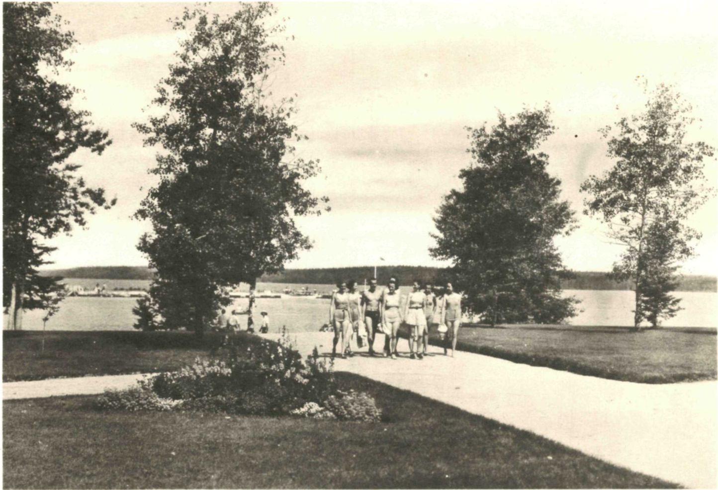
Clear Lake, Pier and Bathers, Riding Mountain National Park, Manitoba, Canada.-42.