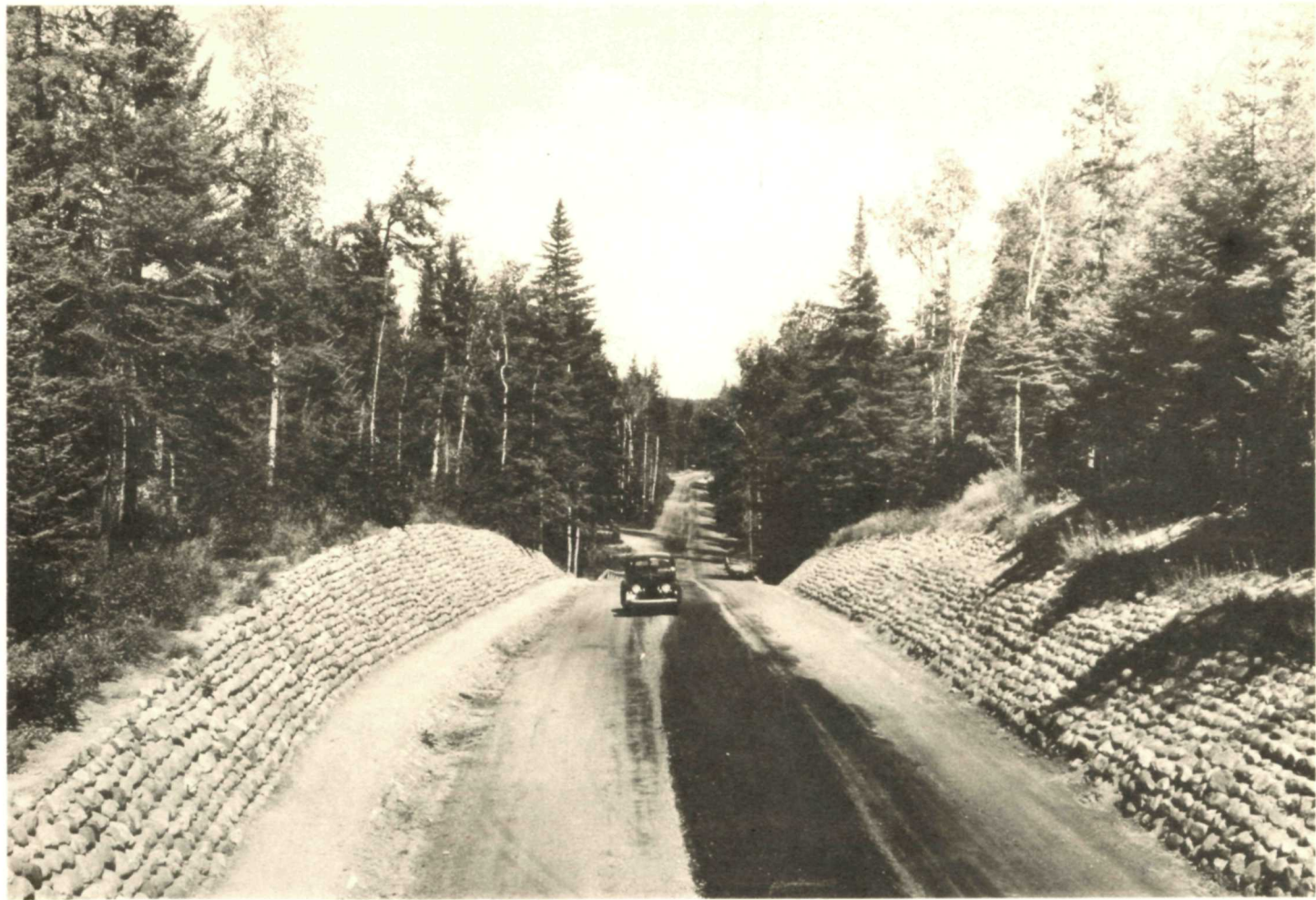
Wasagaming Drive, Riding Mountain National Park, Manitoba, Canada.—47.