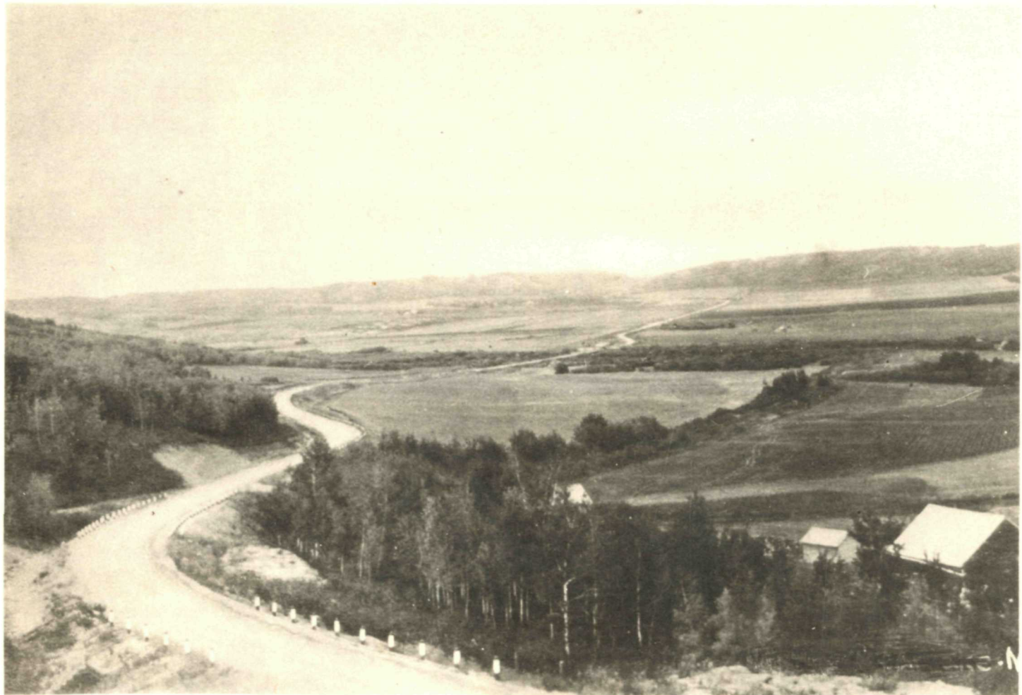
On the Clear Lake-Minnedosa Highway, Riding Mountain National Park, Manitoba Canada.-45.