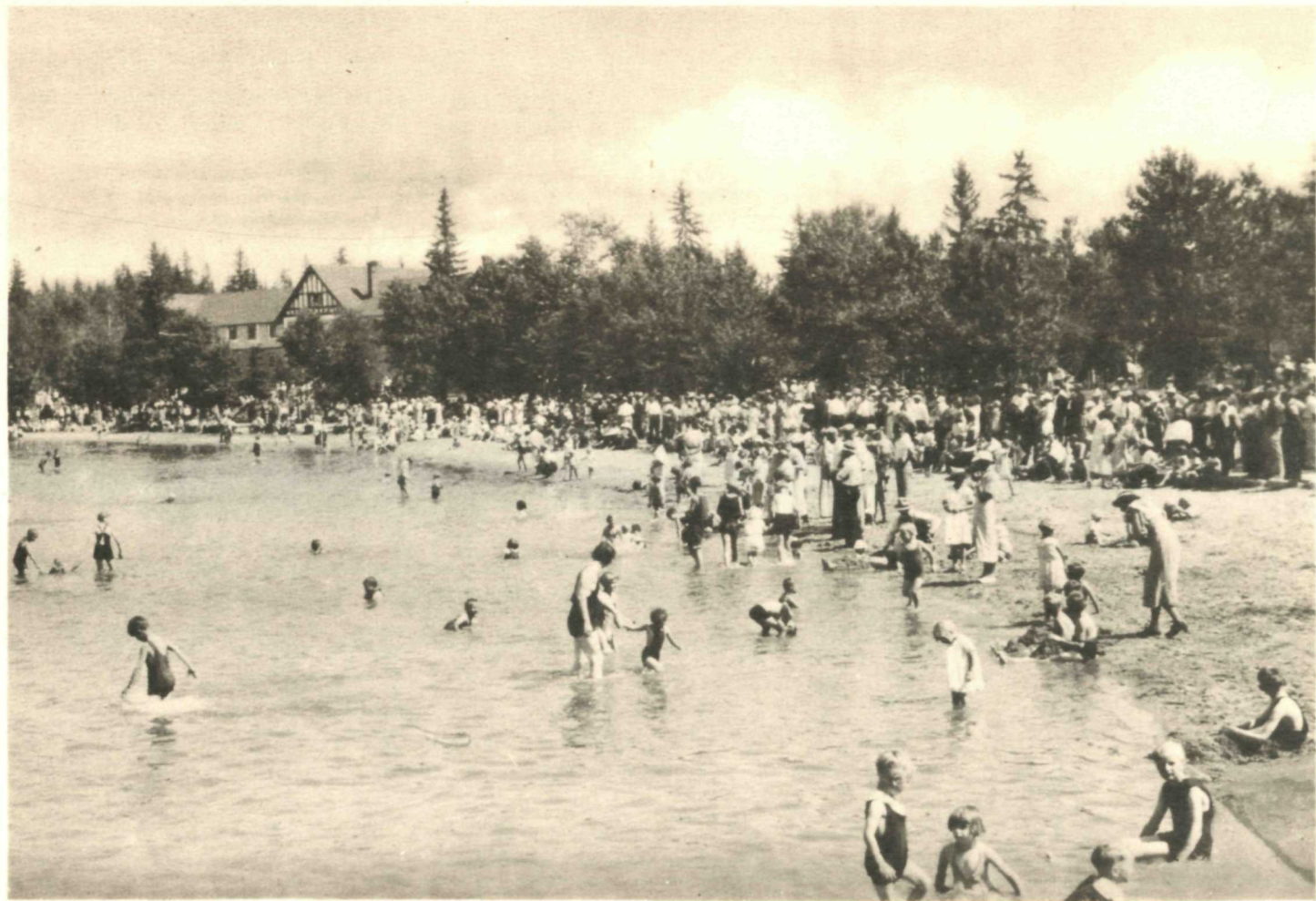
Clear Lake, Riding Mountain National Park, Manitoba, Canada.-24.