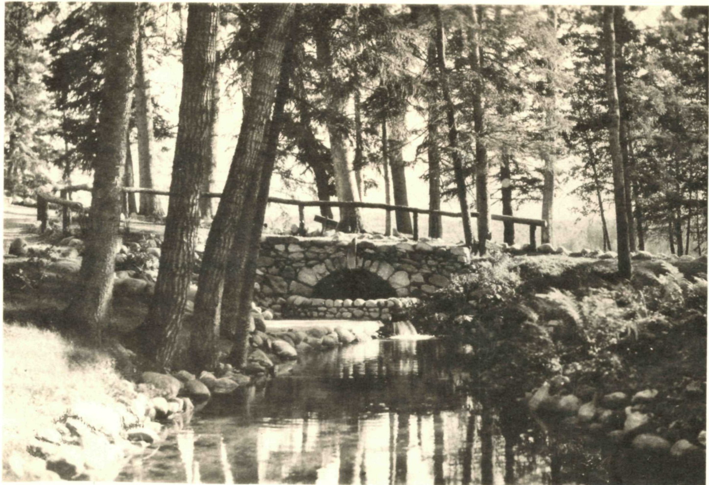
"The Spring", Clear Lake, Riding Mountain National Park, Manitoba, Canada.—27.