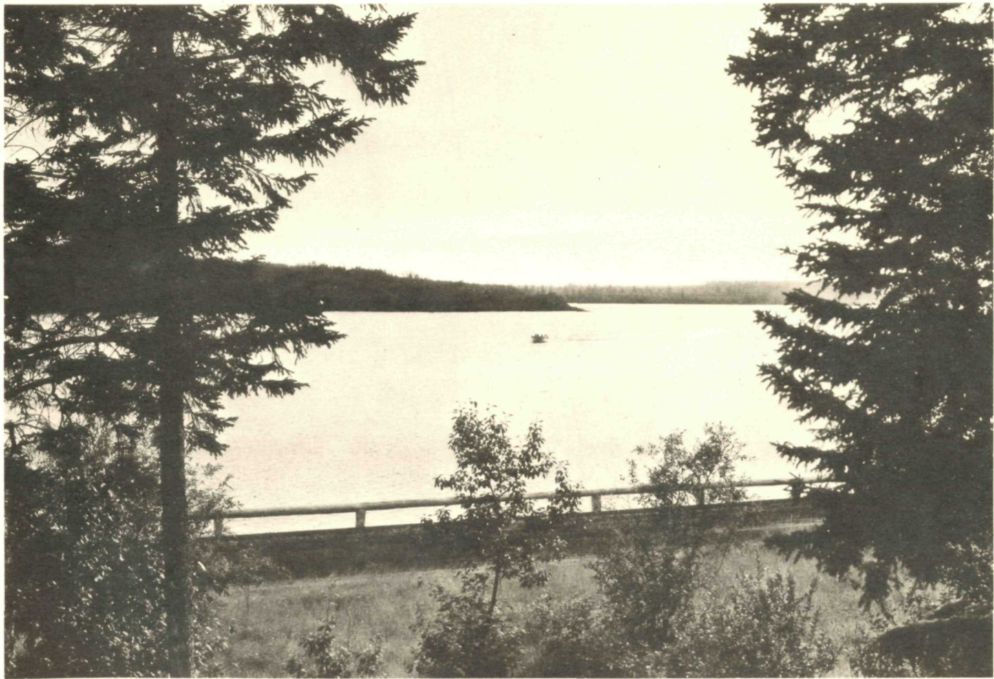
Clear Lake from Glen Beag Road, Riding Mountain National Park, Manitoba, Canada.—43.