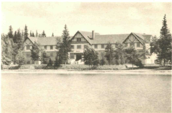
View of Chalet Hotel from Clear Lake, Riding Mountain National Park,