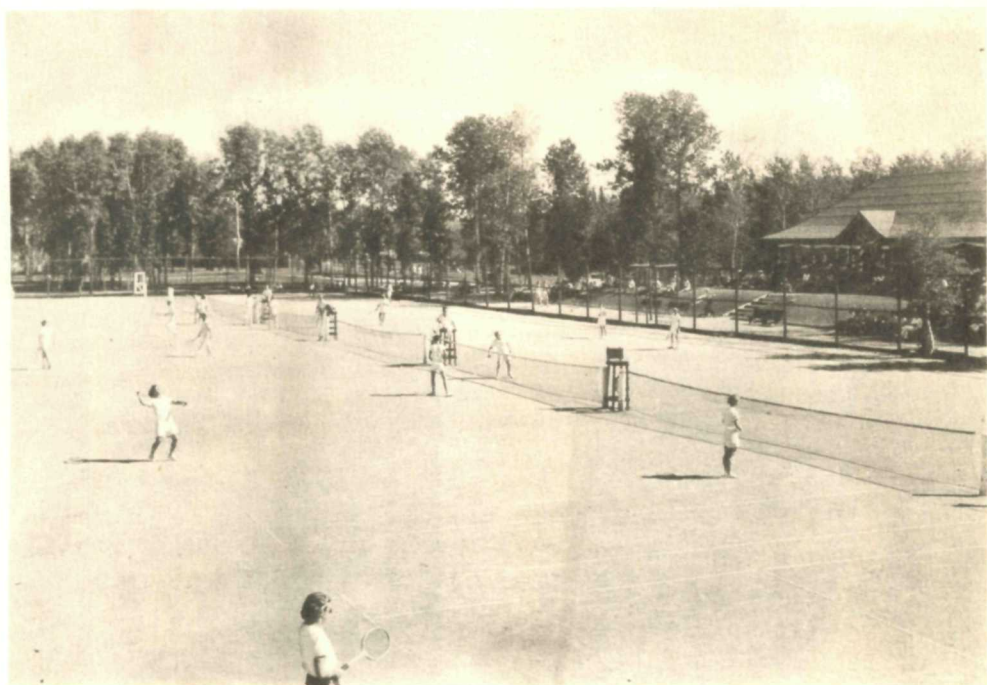
Tennis Courts and Club House, Riding Mountain National Park, Manitoba.