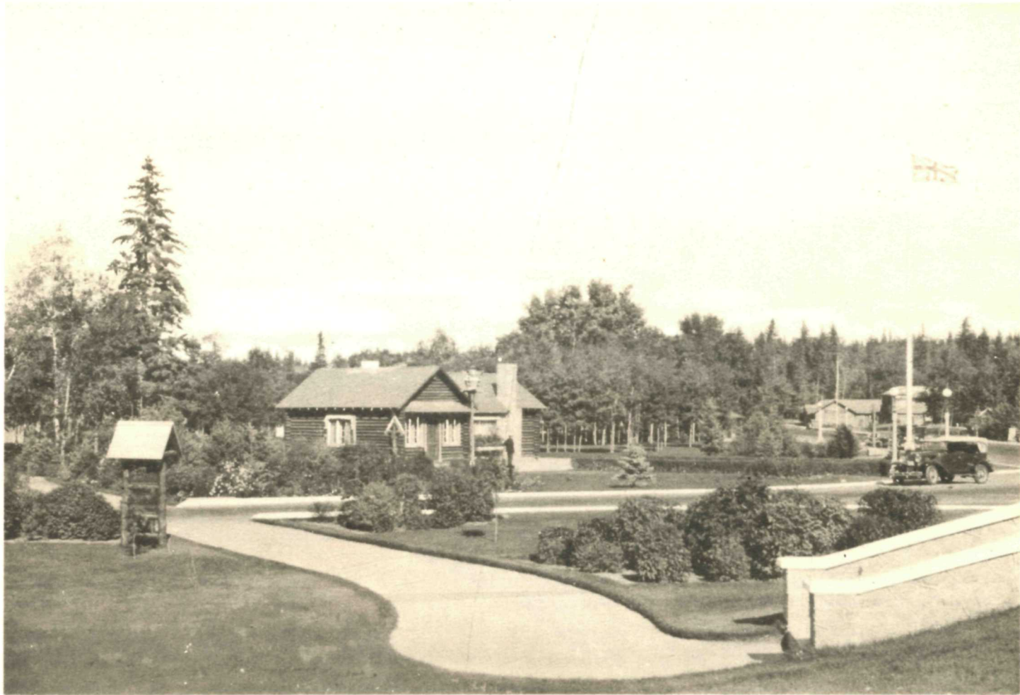
Administration Building, Wasagaming, Riding Mountain National Park, Manitoba, Canada.-25.