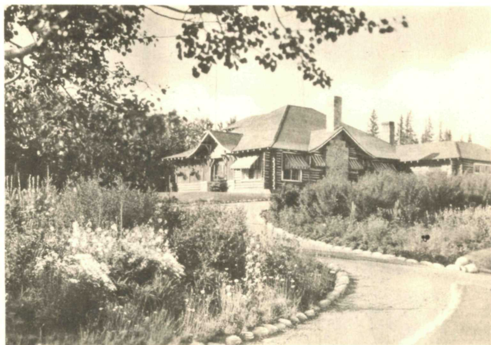
Superintendent's Residence, Clear Lake, Riding Mountain National Park, Manitoba, Canada.—35.