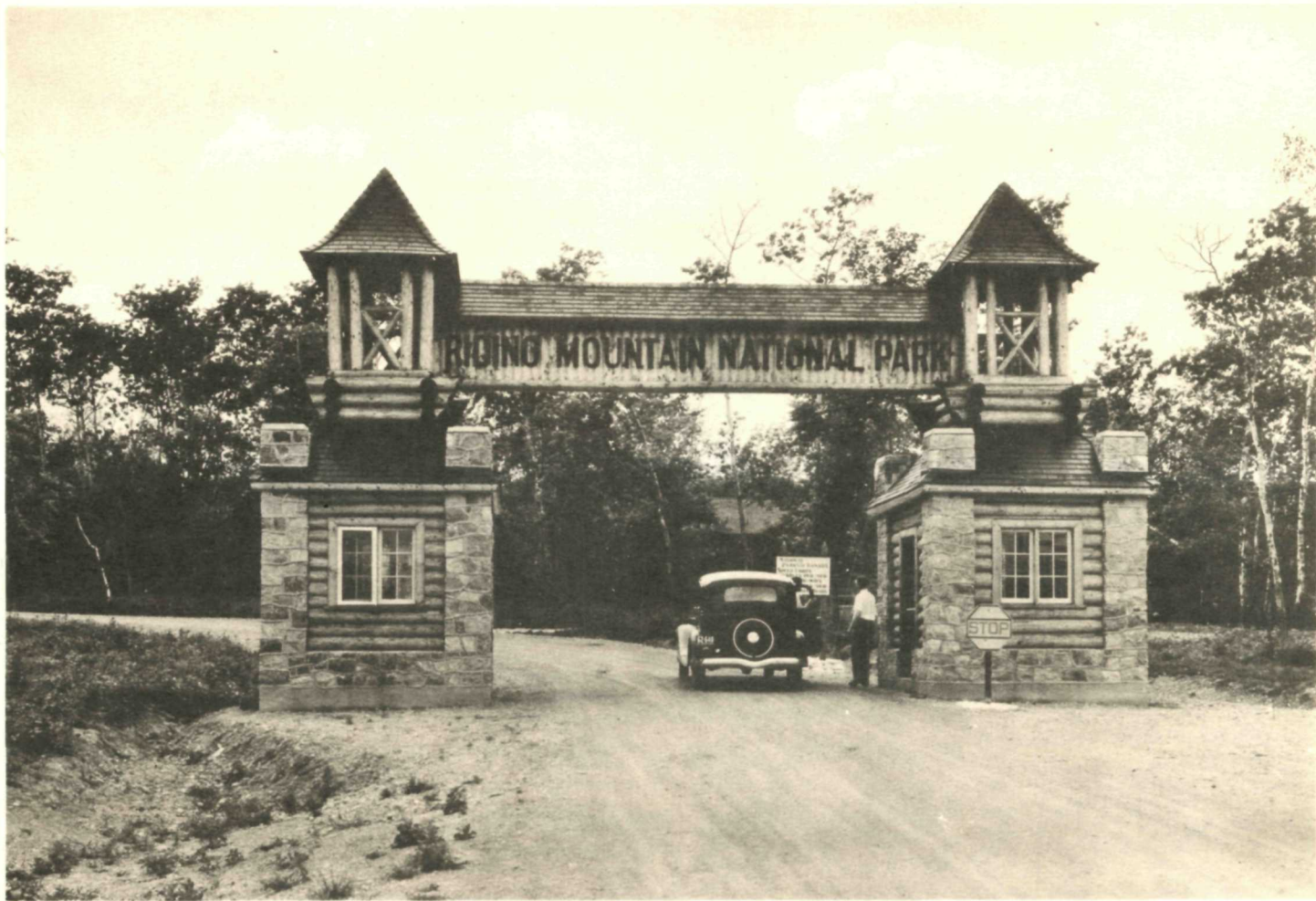
East Entrance Gate, Riding Mountain National Park, Manitoba, Canada.-1.