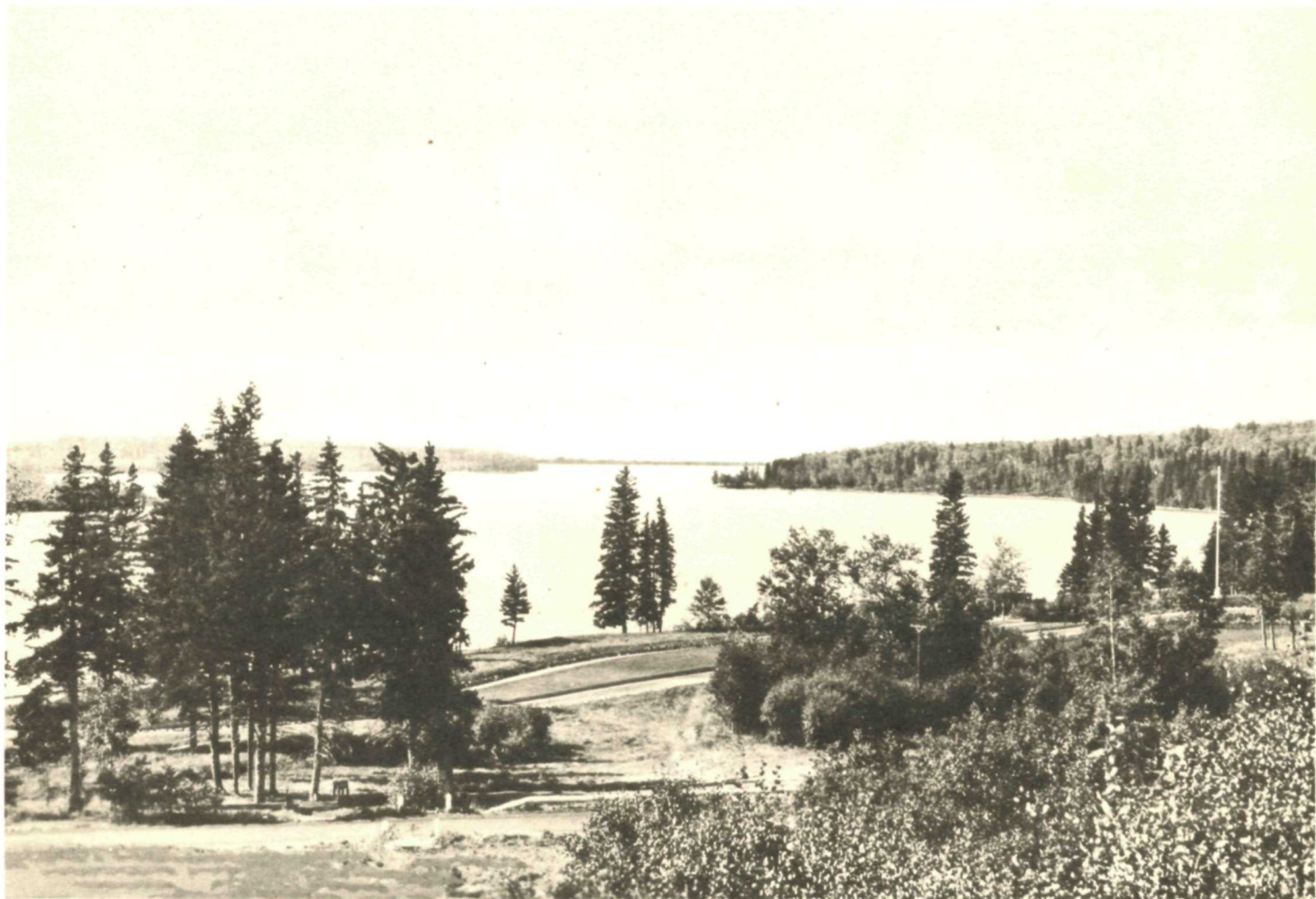
Looking West on Clear Lake, Riding Mountain National Park, Manitoba, Canada.