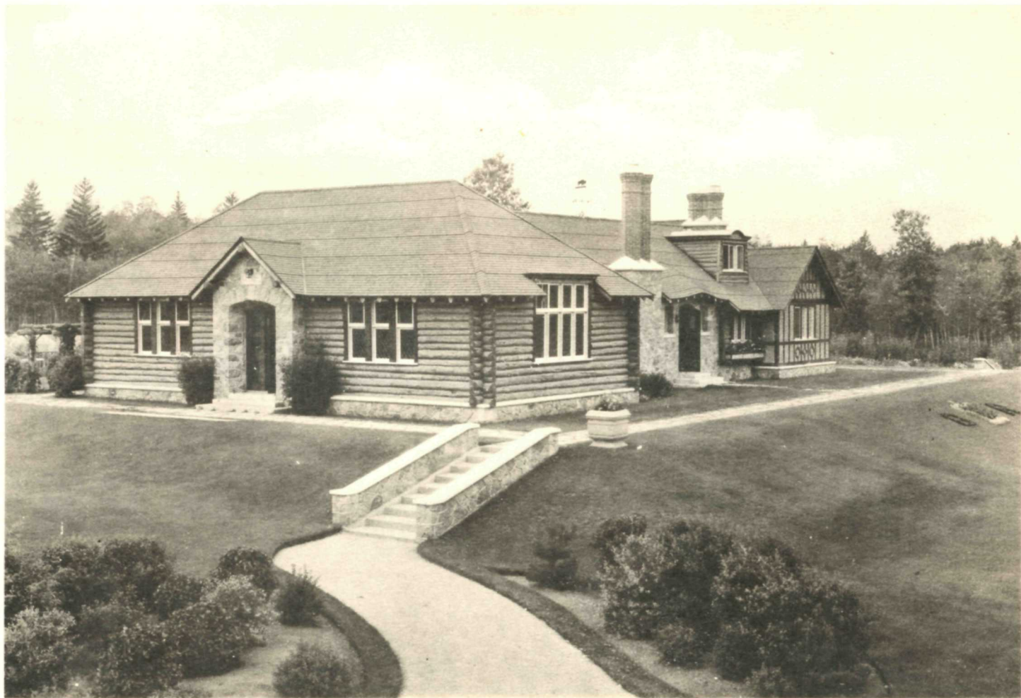
Community Building and Grounds, Riding Mountain National Park, Manitoba, Canada.—46.