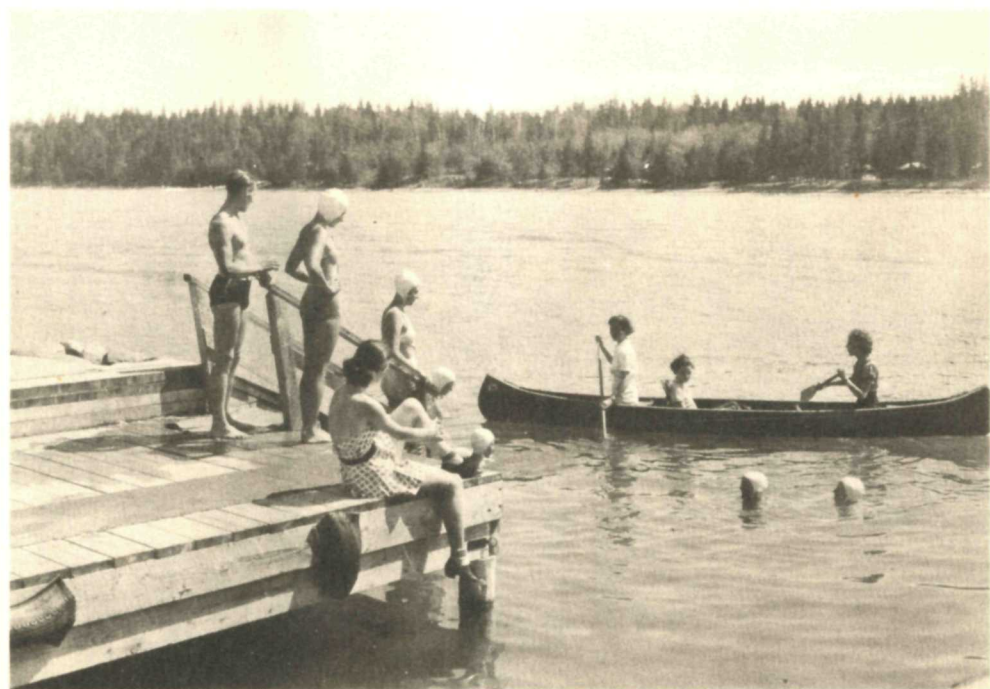
Canoe and Bathers, Clear Lake, Riding Mountain National Park, Manitoba.