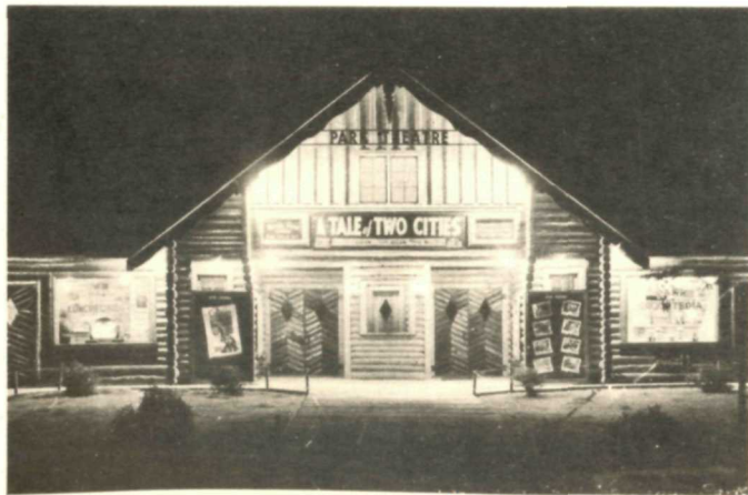
Park Theatre, Riding Mountain National Park, Manitoba, Canada.—36.