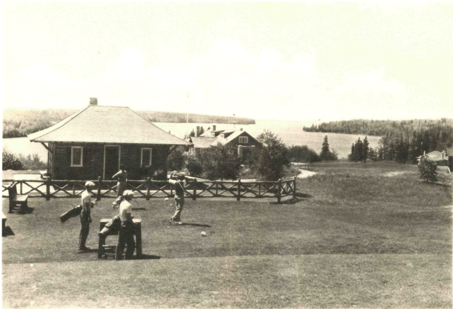
Golf Club House and Caddy House, Clear Lake, Riding Mountain National Park, Manitoba.