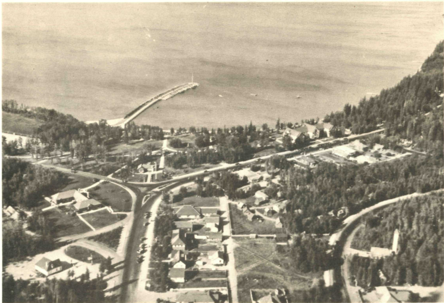
Wasagaming and Clear Lake from the Air, Riding Mountain National Park, Manitoba, Canada.—41.