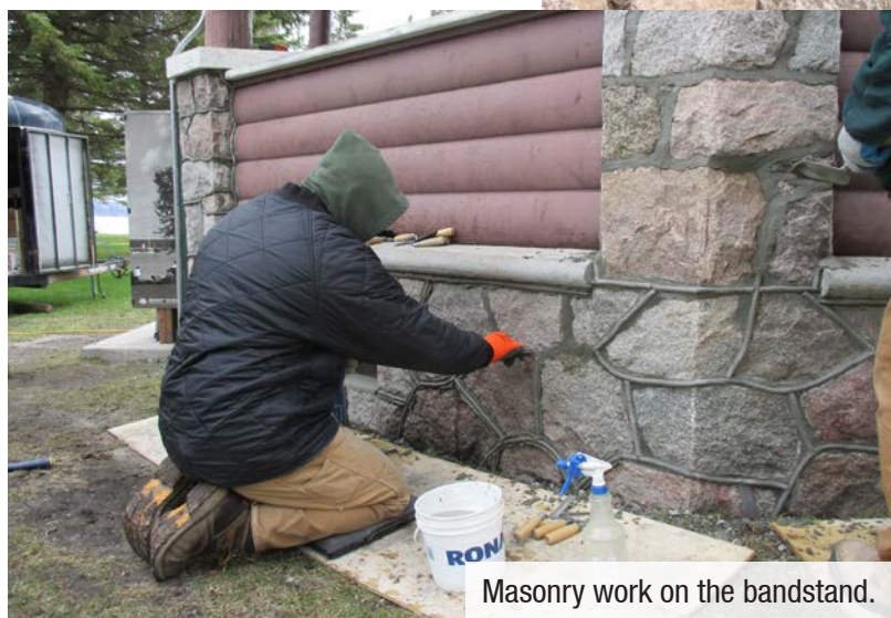
Masonry work on the bandstand.

If you haven't been to the East Side of the park, this is a beautiful place to start! Landscaping and trail work was completed last summer and fall. A new washroom will be installed this summer.