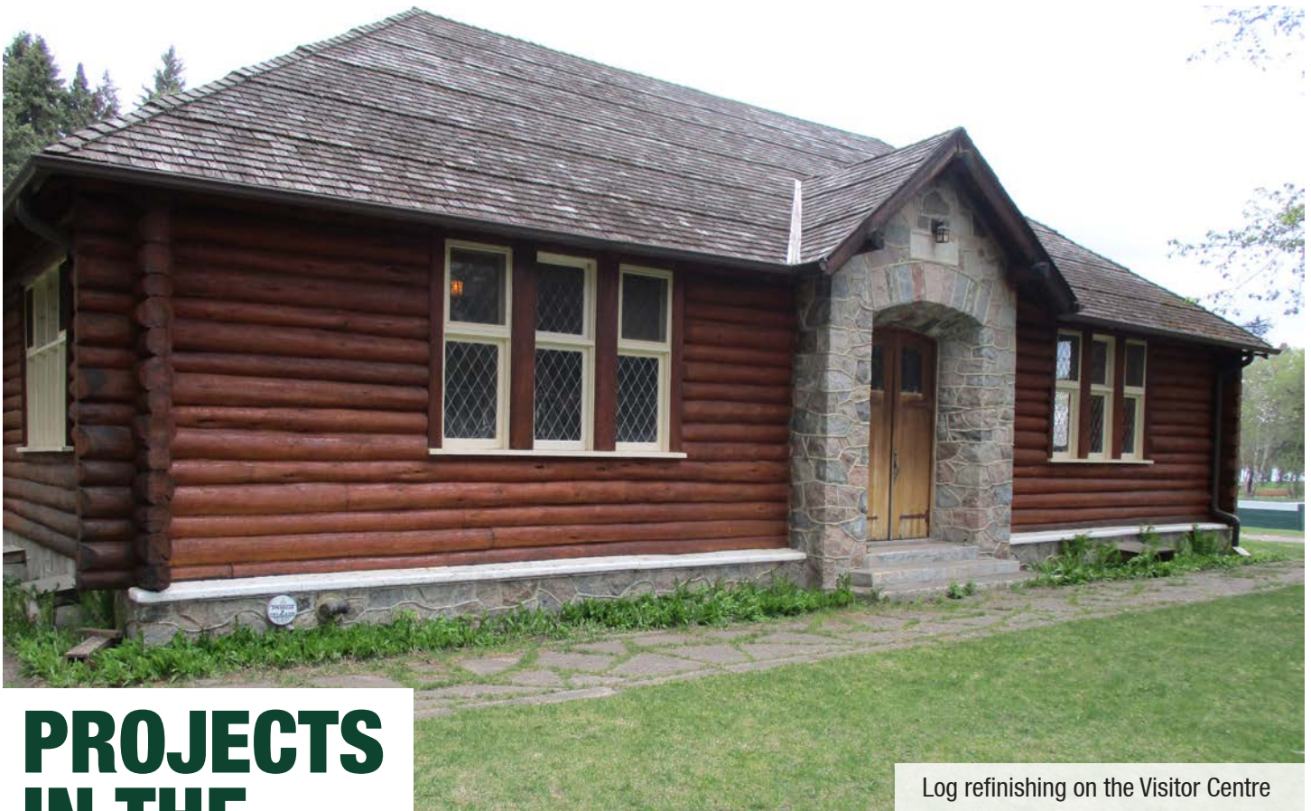
Log refinishing on the Visitor Centre