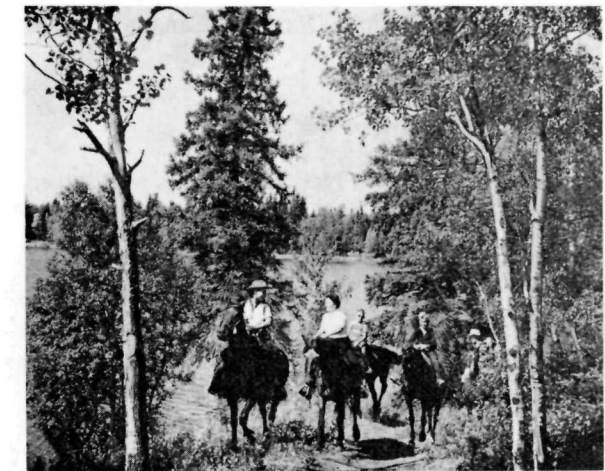
Trees of many kinds flourish in the Park.

Dogs and cats may accompany visitors into the Park. For the protection of Park animals, however, dogs must be kept on leash.