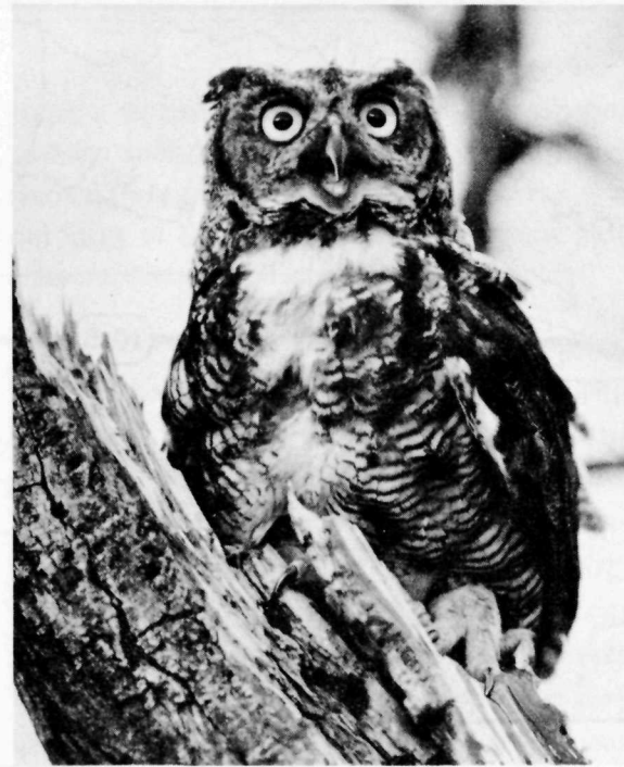
Great horned owls may be seen in the Park.

Many of the natural features of Riding Mountain National Park were shaped by the great glaciers of the Ice Age, the last of which melted from the area about 10,000 years ago. Riding Mountain is