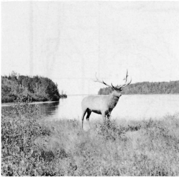
A bull elk is alerted.

these wild animals are extinct in this region. In 1931 an area of 2,000 acres was fenced in the Lake Audy area and an exhibition herd introduced from what was then Buffalo National Park in Alberta. When seen grazing on the prairie land in the enclosure, these animals recall to mind thrilling days when Indians, armed only with bow and arrow, pursued thundering herds across the vast reaches of the western prairie.