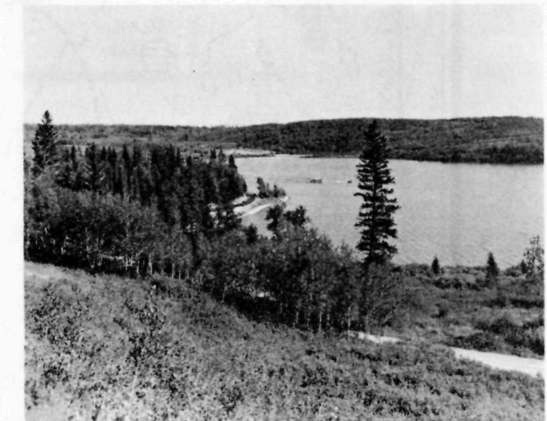
Glacial action and erosion have molded these hills and basins.

Although herds of American bison once roamed over the western plains in great profusion,