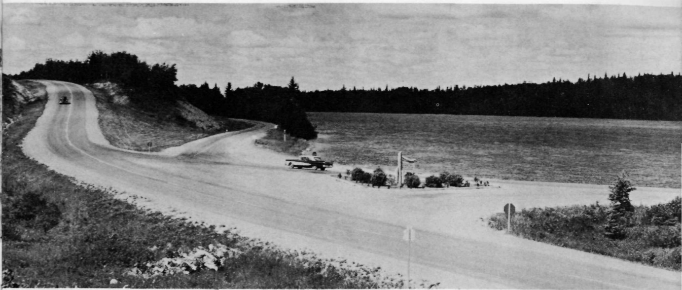
East End of Clear Lake

Minister of Northern Affairs and National Resources