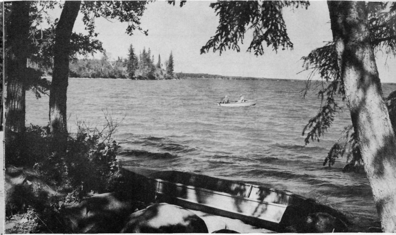
Fishing at Clear Lake

For visitors travelling with cabin trailers or carrying their own camping equipment there is accommodation in the Government camp-ground. It is situated in a beautiful grove west of the business section of Wasagaming facing Clear Lake, and within easy reach of stores, restaurants, and garages. Camp privileges are available on payment of a small fee, and include the use of a camping lot and community kitchen shelters equipped with stoves, tables, firewood, and running water. Modern toilet buildings are also located in the camp-ground. Convenient taps furnish an ample supply of clear, pure water. Camp-grounds, less completely equipped, are also available at Lake Katherine, Moon Lake, Lake Audy, and Whirlpool Lake.