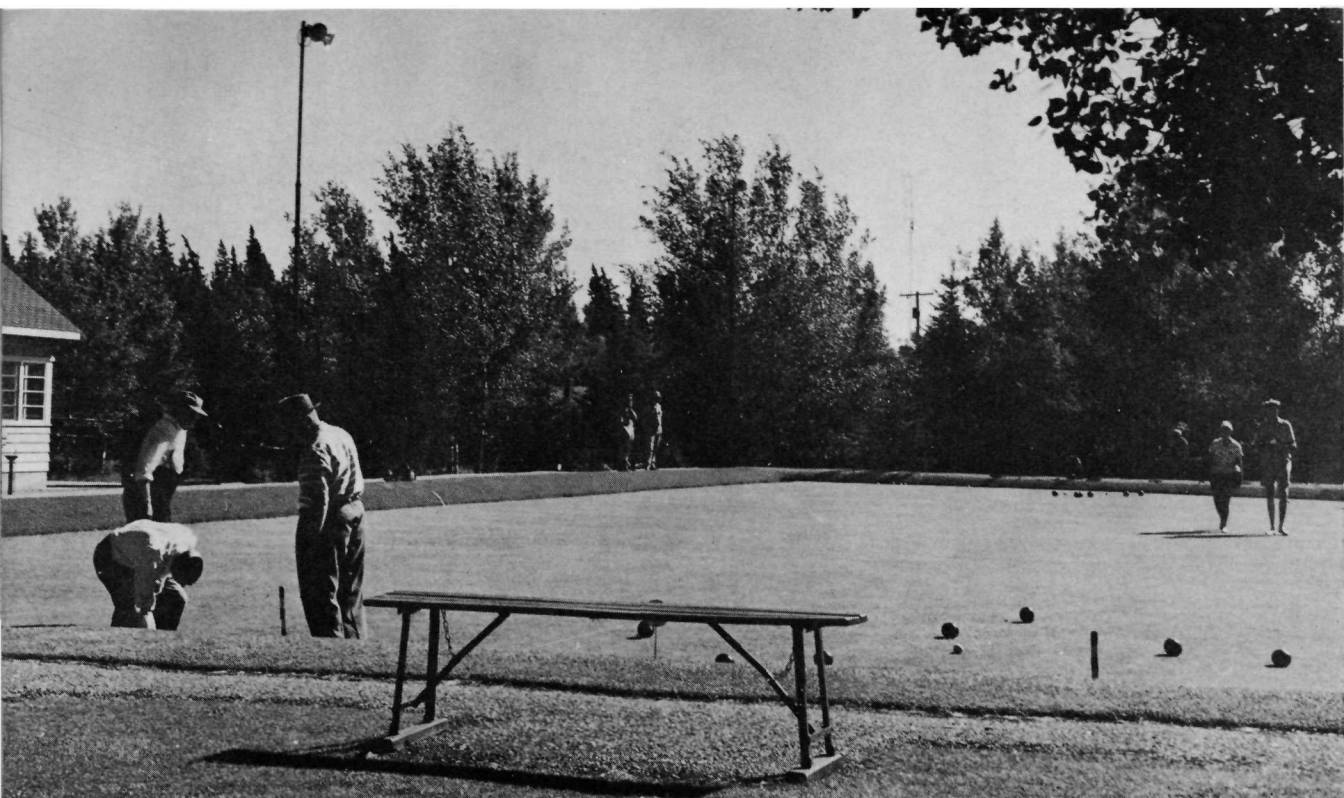
Bowling Green at Wasagaming