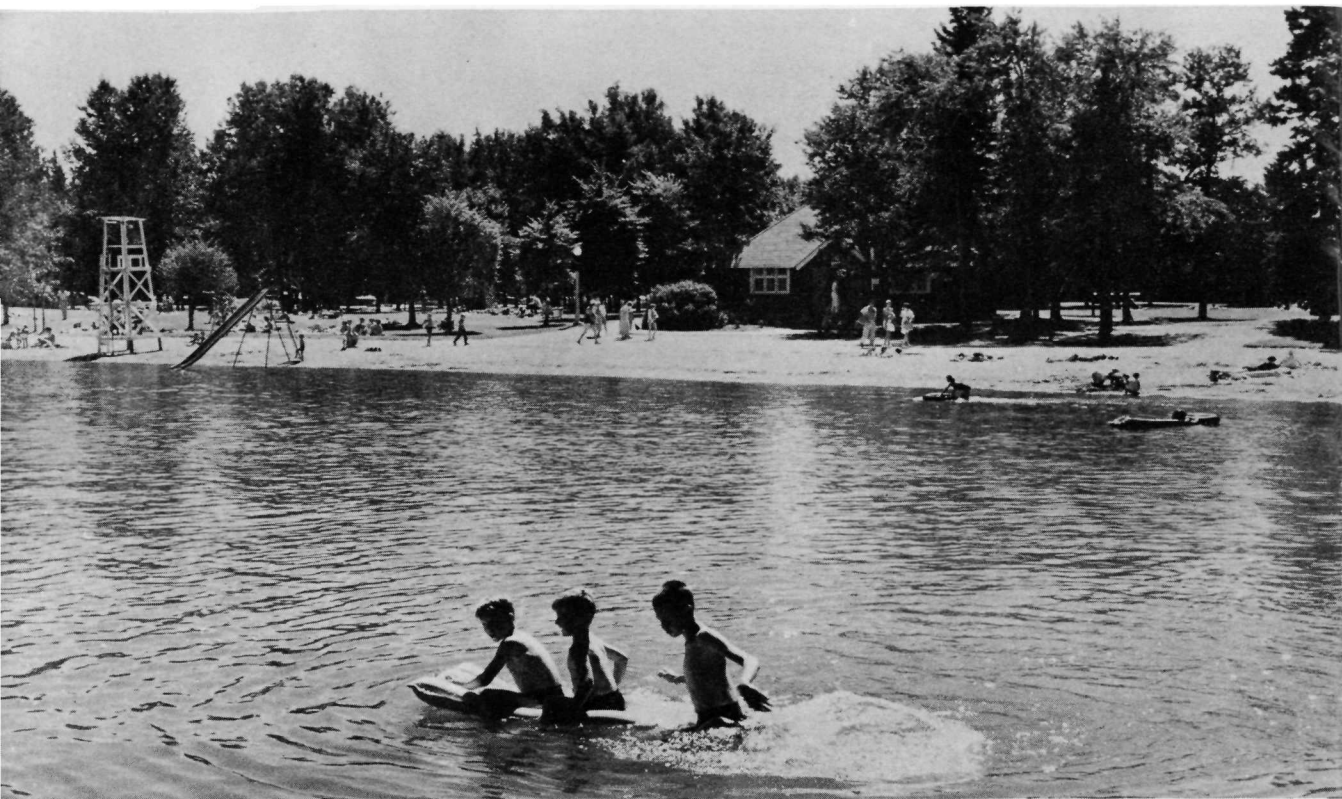
Cooling off at Clear Lake