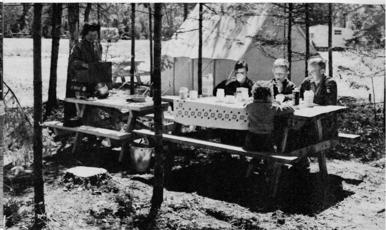
Lunch in a Shady Grove

—the home of the Assiniboines and Crees. With the acquisition of firearms, tribal sports and hunting eventually gave way to savage hostilities, and raids into rival territories ensued. As the buffalo, staple source of supply for the western tribes, began to disappear, the Assiniboines moved westward, and left the Crees in possession of the region. The ridges are believed to have been Indian highways for years, and one of the early explorers records that shale outcroppings near the summit of Riding Mountain were used by the Indians for making clay pipes.