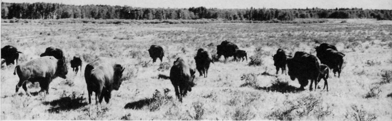
Buffalo near Lake Audy