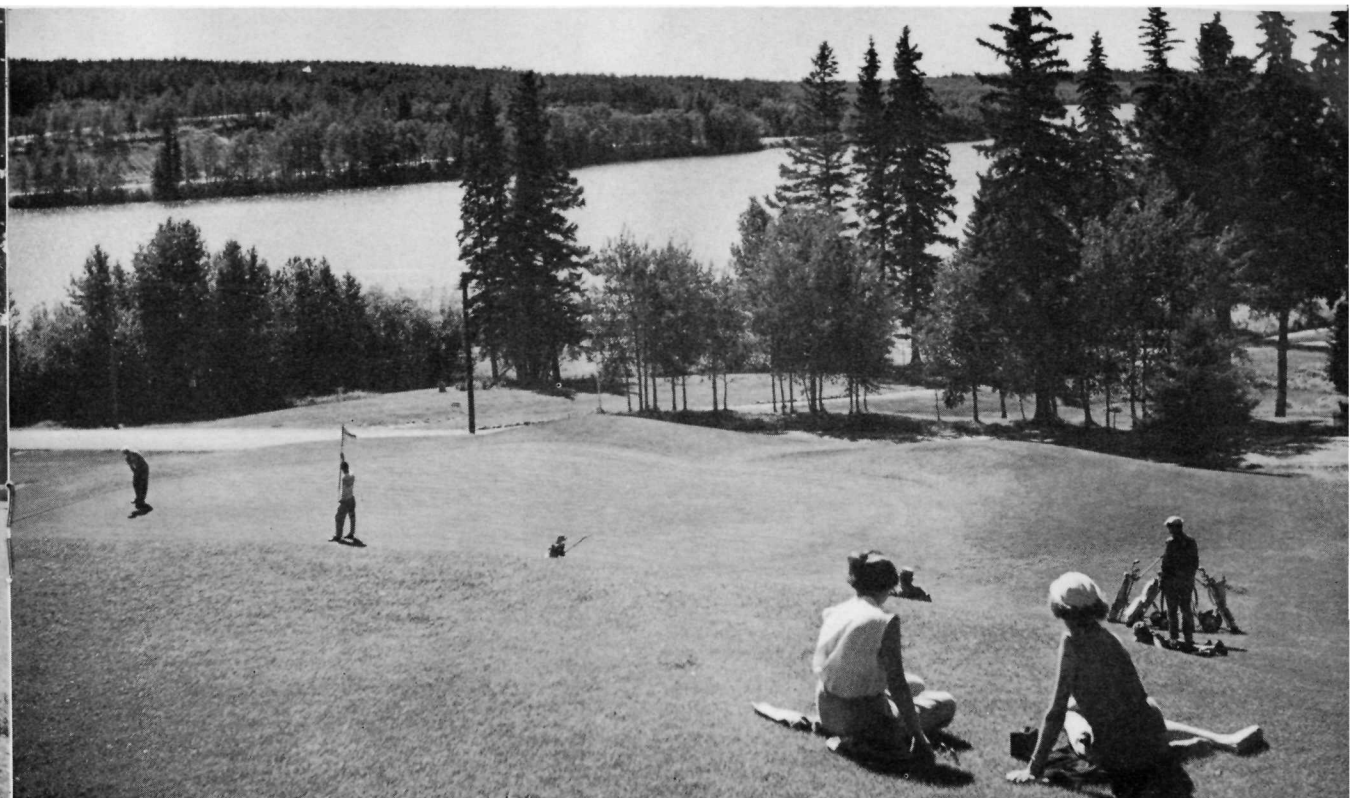
Spectators watch a golfer putt on the 9th green of the Golf Course

a riot of colour. At varying periods may be seen wild roses, twinflower, marsh marigold, orange lily, pasque flower, bunchberry, wintergreen, fireweed, Indian paint brush, and Indian pipe, as well as golden-rod, violet, and brown-eyed susan.