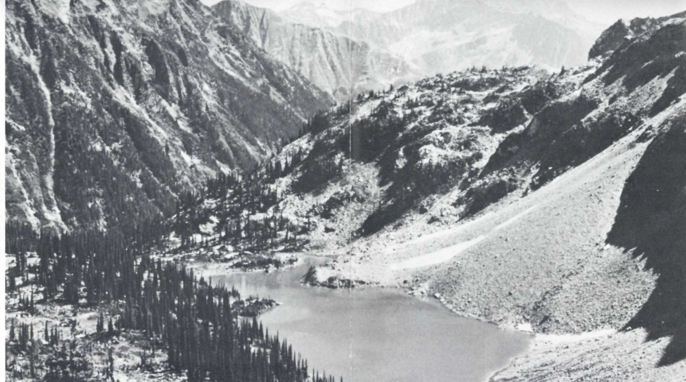
The Lake of Jade.

Millar and Eva Lakes: From Summit of Mt. Revel-