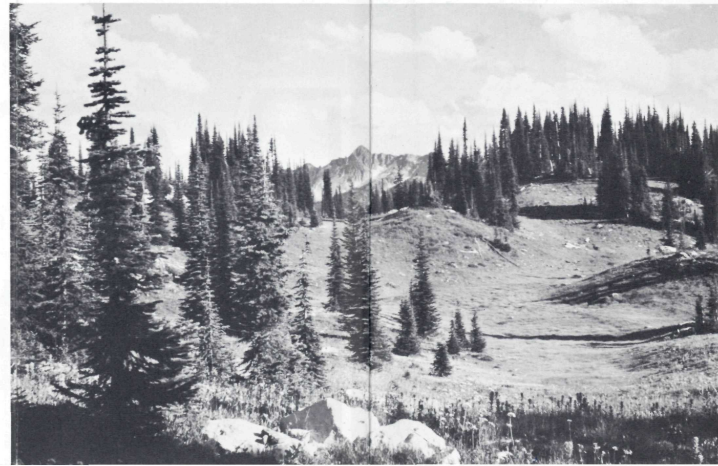
Mount Tilley and Mount Mackenzie as seen from the summit of Mount Revelstoke.

One of the grandest viewpoints on the auto road is near the summit. From here, at an elevation of some 5,000 feet, can be seen the Illecillewaet Valley and the mountain ranges to the south and east.