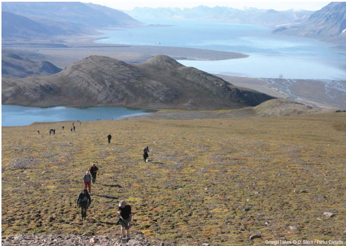
Omega Lakes

Hikers can explore the park from Tanquary Fiord Station. Historic Fort Conger visits are possible by special permission and will require a Parks Canada staff person to accompany your group.