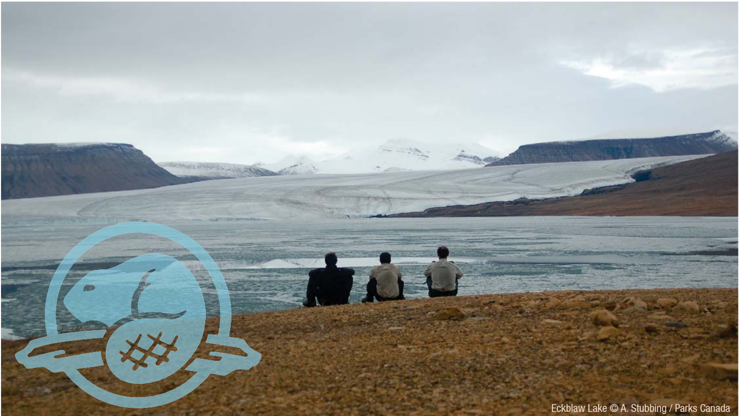
Eckblaw Lake