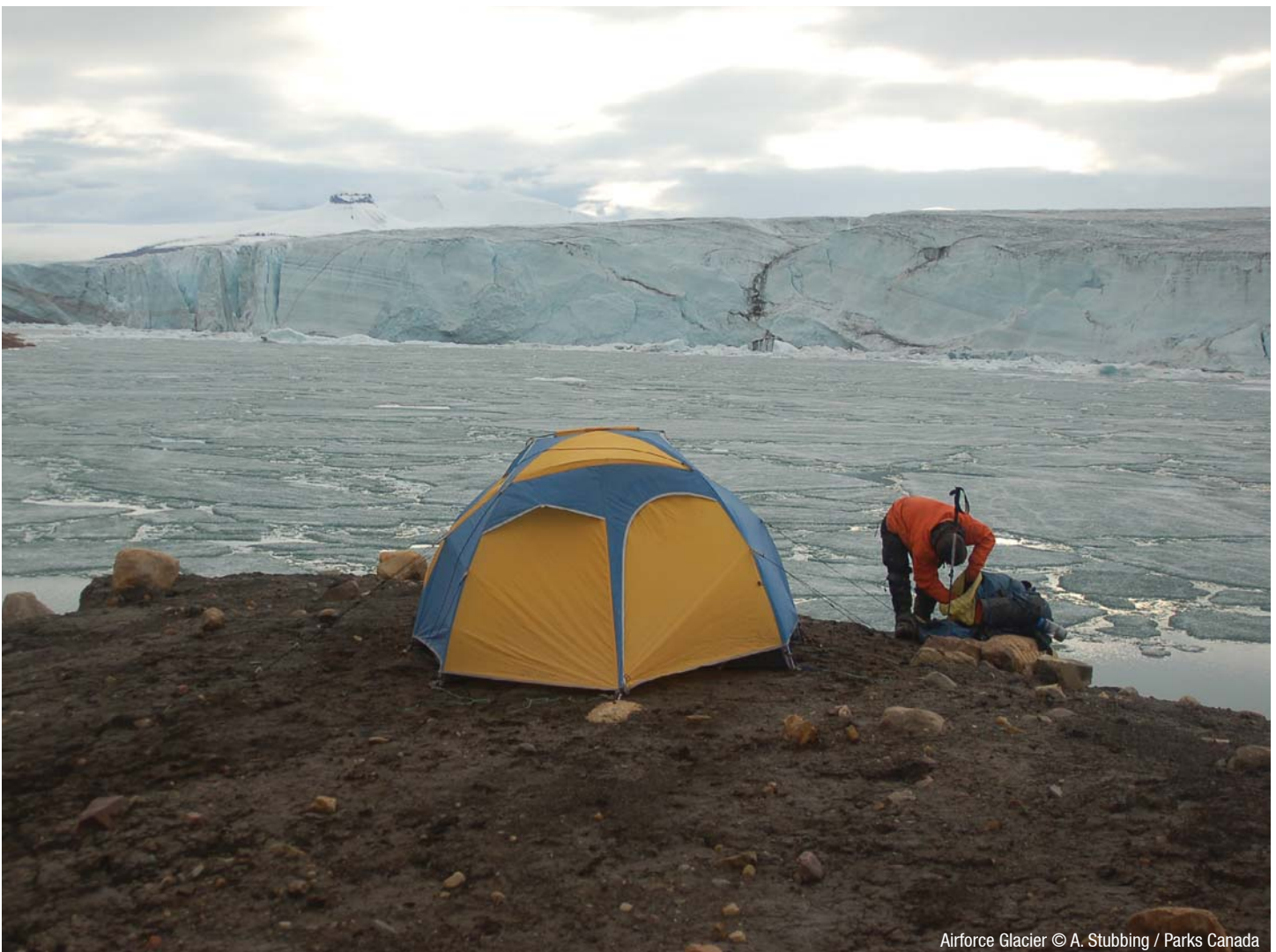
Airforce Glacier

These are the fees, at time of print. New Fees will soon be implemented. They are likely to be slightly higher.