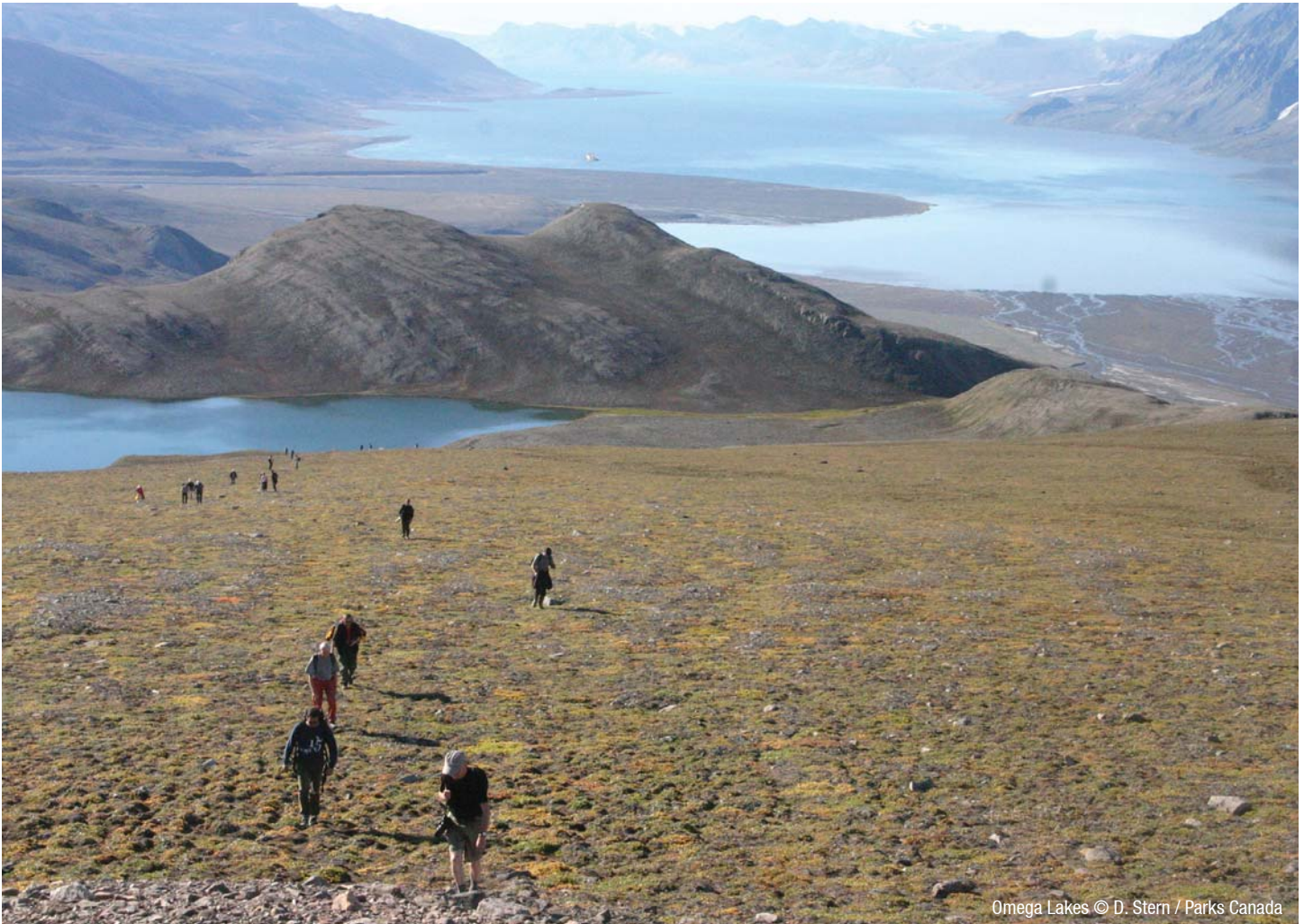
Omega Lakes

Hikers can explore the park from Tanquary Fiord Station. Historic Fort Conger visits are possible by special permission and will require a Parks Canada staff person to accompany your group.