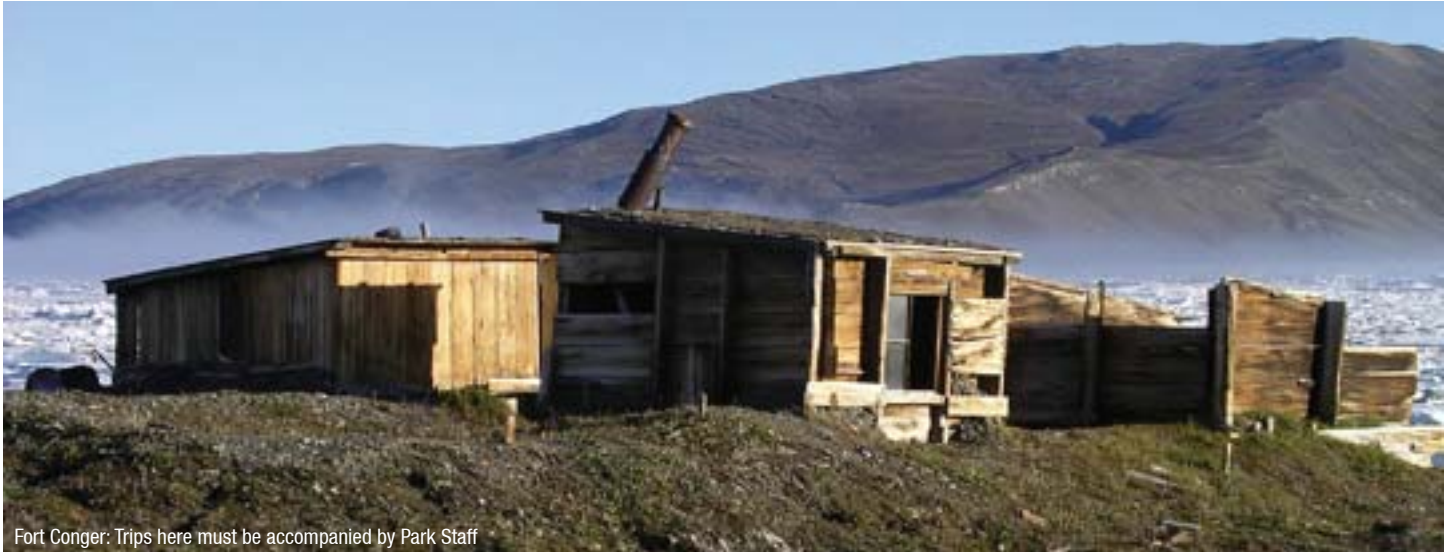
Fort Conger: Trips here must be accompanied by Park Staff

Your group should have advanced skills in wilderness first aid and be prepared to handle any medical, wildlife or weather related emergency. If someone in your group is uncertain about their skill level, consider travelling with an experienced guide. Contact information can be found in this package.