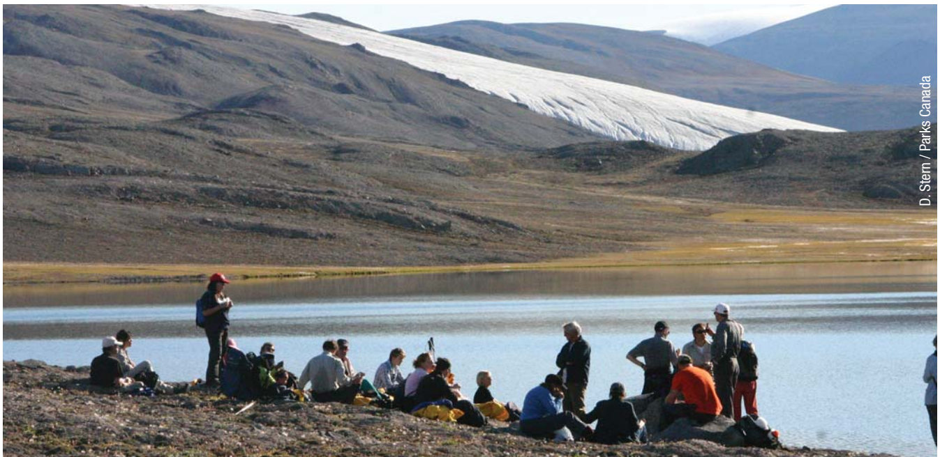
D. Stern / Parks Canada