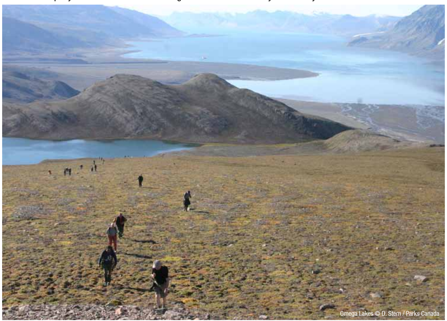
Travelling to the North Pole

Many groups choose to hike a 9-10 day loop from Tanquary Fiord around the Ad Astra and Viking Ice Caps or a 11-12 day hike from Tanquary Fiord to Lake Hazen following the MacDonald and Very River Valleys.