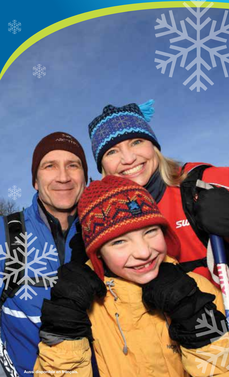
Aussi disponible en français