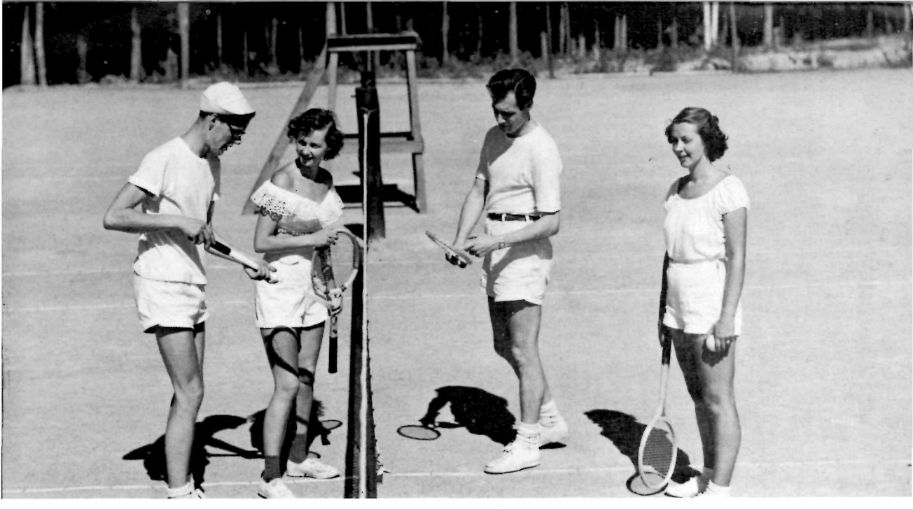
Tennis in a Forest Setting

outings to those desiring to ride or hike. Saddle horses may be hired from an outfitter at Waskesiu.