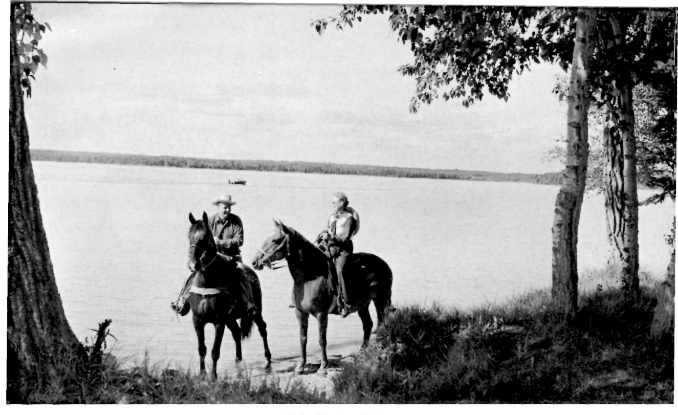
Early Morning Ride

route may be taken by following Highway 6 for eight miles; Highway 11 can then be taken northeastwardly to Saskatoon; from Saskatoon, Highway 5 which connects to No. 2 on to Waskesiu. An alternative route from Regina may be used by following No. 6, then to Highway 11 and connecting to Highway 2 through to the Park. From Winnipeg, Manitoba, on the east, connection is made over Highway 1 via Regina, and from Calgary and Banff. Alberta, on the west, Highways 1 and 2 also provide a direct approach. Prince Albert National Park is approximately 480 miles northwest of Riding Mountain National Park, by highway.