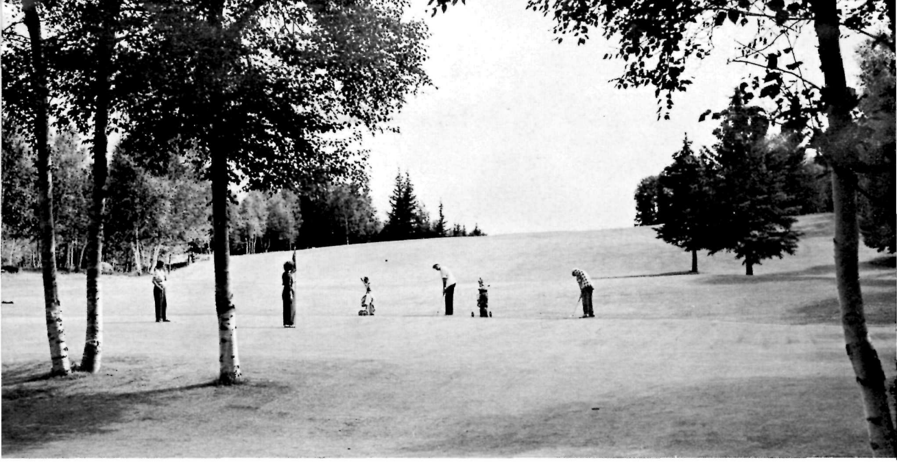
The 18th Green

friendship with wild animals, particularly the beaver.