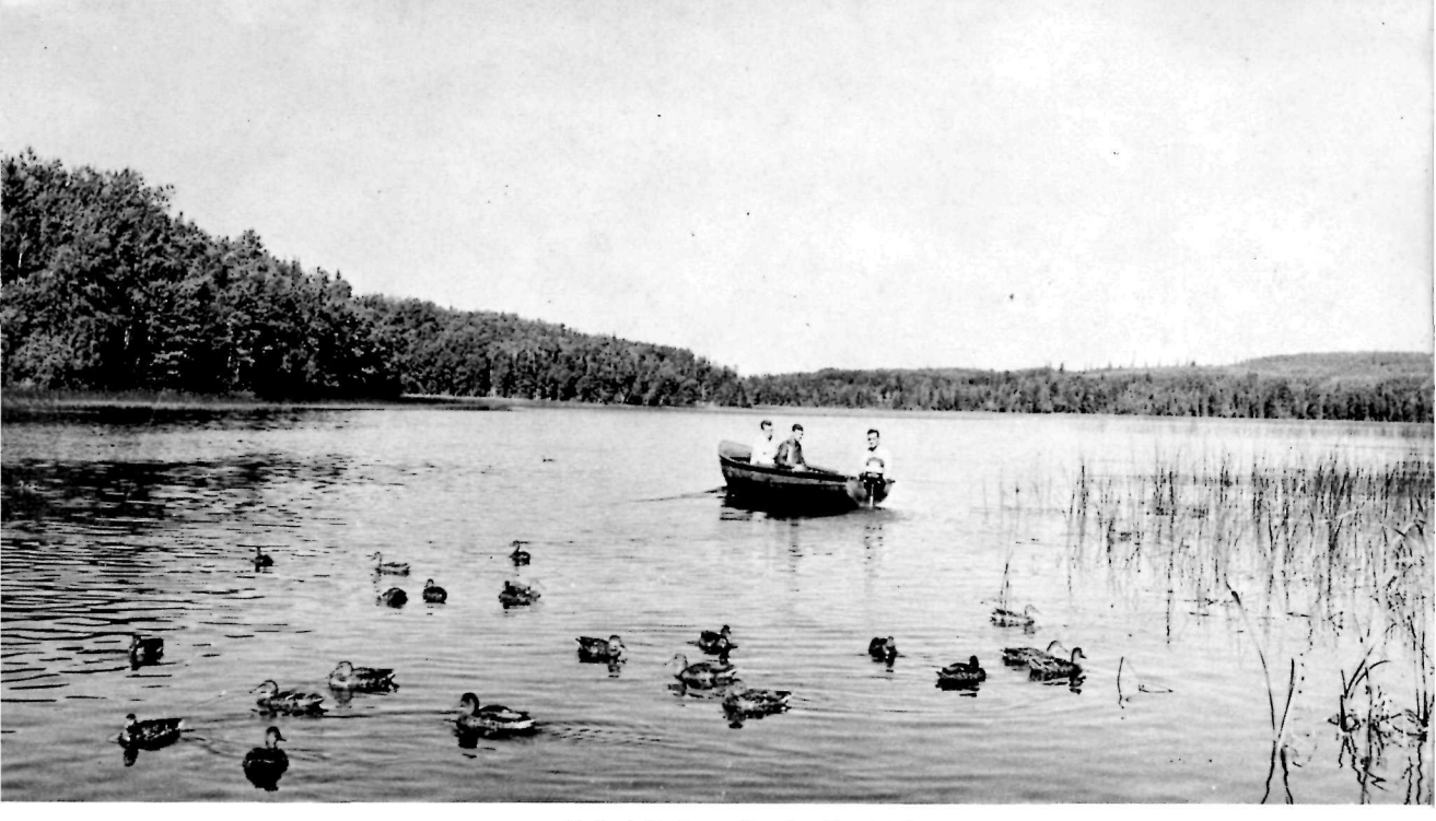
Mallard Ducks at Hanging Heart Lake