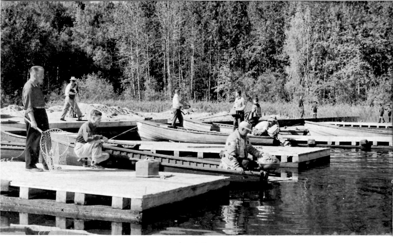
Anglers at Heart Lake

and black poplar. Also found are balsam-fir and tamarack, numerous species of shrubs, and an abundance of wild flowers. In early autumn these trees and shrubs don a brilliant mantle of orange, crimson, and gold, which blends with diverse shades of green into a riot of colour.