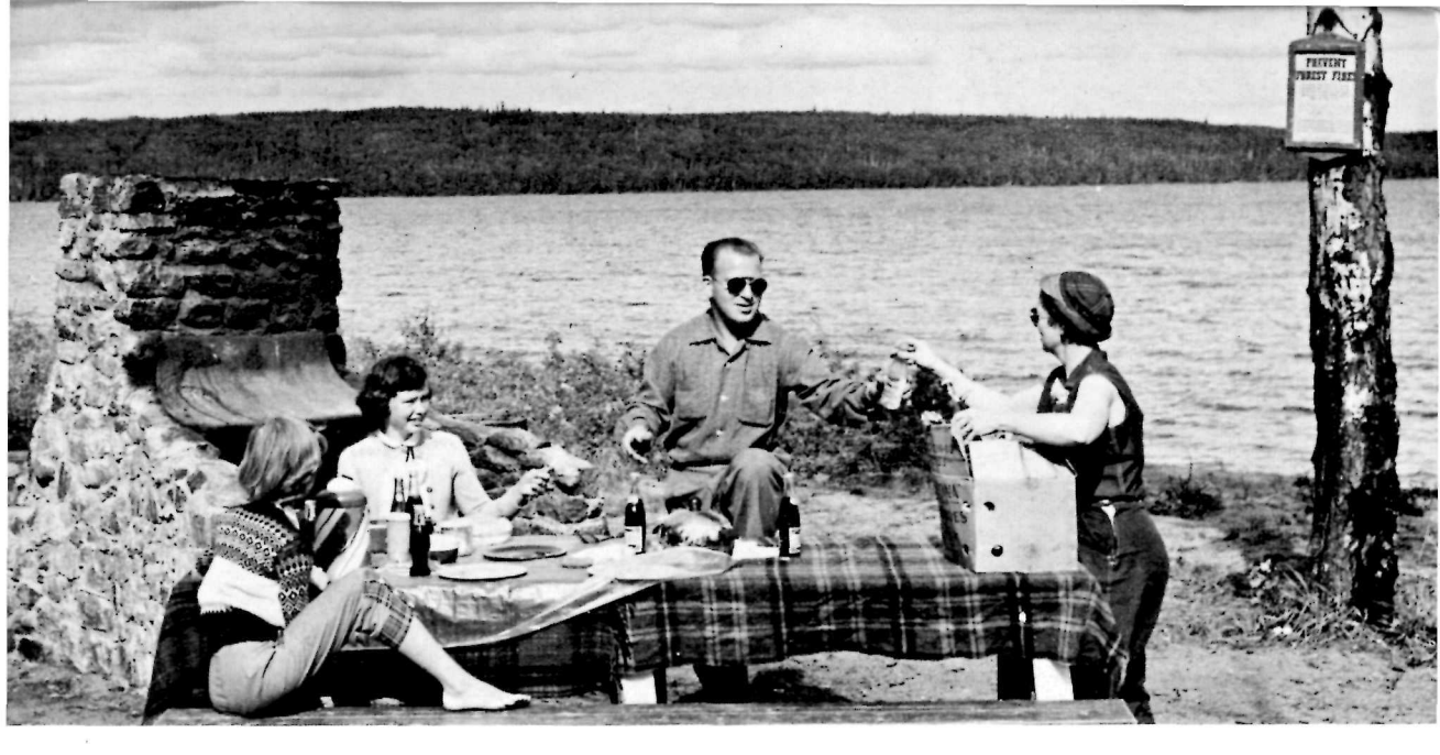
A Picnic on the Lake Shore

green, an orange pouch directly under the bill and a long, curved upper beak. In the mating season it wears a tiny tuft of feathers over each ear, a decoration which has given it its name. At a distance the birds look a good deal like loons but they are much more graceful in movement, swimming with a graceful serpentine motion. The cormorants are expert fishers, often carrying on the business in a communal fashion that is extremely interesting to watch. To quote Mr. Taverner: