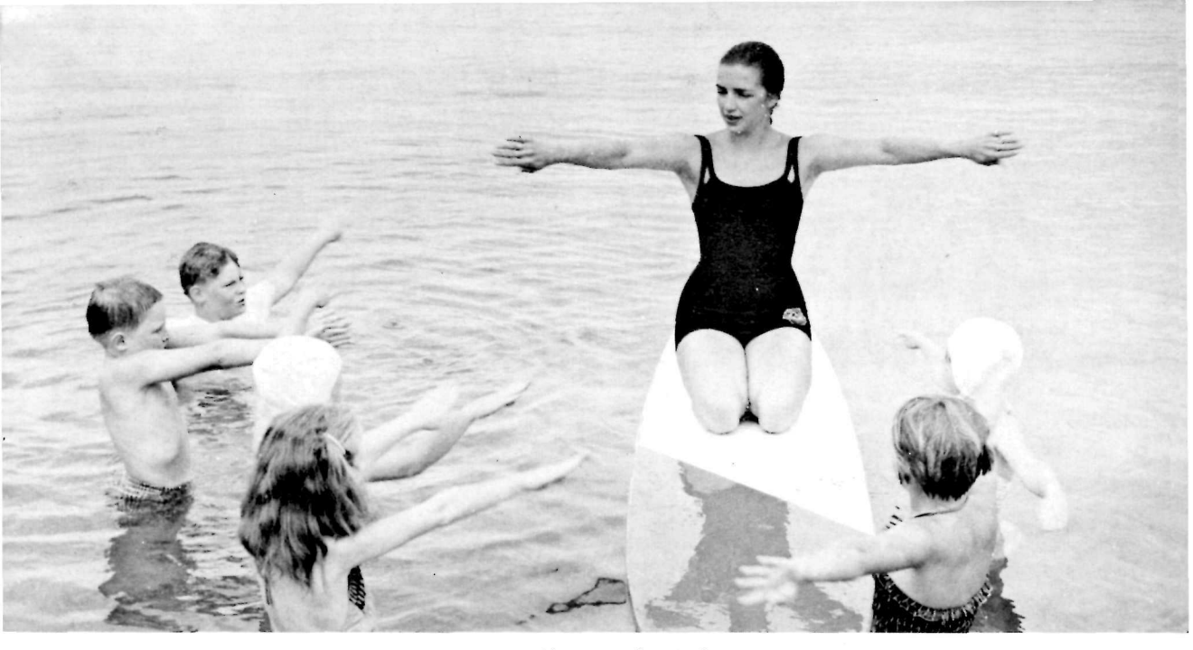
Swimming Class at Lake Waskesiv

Narrows. One of the hotels has dining-room facilities; the bungalow camps and apartment courts are equipped with housekeeping necessities.