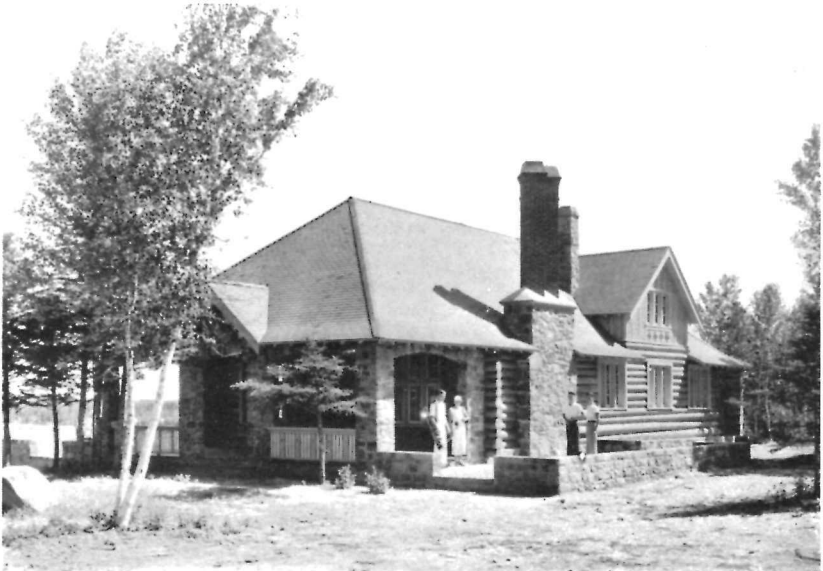
The Golf Club-house

An airport and anchorage for seaplanes has been established by the Government at Waskesiu lake as a base of operations for aircraft operating in forest patrol work and also by commercial firms engaged in other activities. This airport is situated in a bay about five miles southwest of the townsite of Waskesiu and is accessible by motor road from the Park highway. Rates charged for the use of this port are in accordance with those laid down by the Department of National Defence.