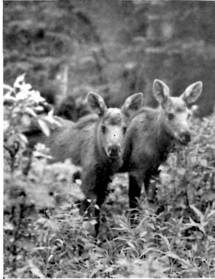
Twin Moose Calves

Kingsmere lake, one mile to the north of Waskesiu lake, has an elevation of about twenty feet higher than the latter. A small stream, known as the Kingsmere river, unites the two and forms a pleasant waterway from one to the other. Leaving Waskesiu lake, for the first half-mile the paddling is easy. The waters flow down without a murmur, slipping silently as an Indian, through a thick forest of willow, white birch, poplar and spruce. Here and there, in the low places along the shores, families of wild ducks make their home and at the sound of the paddle a little brood of ducklings will often scurry to cover. Roundingsome bend one may come, too, upon a moose feeding by the water's edge or catch a glimpse of a deer coming down to drink. About half a mile from Kingsmere lake, however, one strikes a stretch of picturesque rapids, about a quarter of a mile long. Here the canoe must be either pulled up through the rough water or the short portage trail taken through the woods. A light railway equipped with a hand truck has been constructed at this point to assist in the transportation of canoes and luggage. Beyond the rapids another one-quarter of a mile or so of quiet water brings one into Kingsmere lake, where a good campsite is found about one-quarter of a mile to the left on a high plateau with ample shade and grass. A kitchen shelter, equipped with campstove and tables, has been constructed at this point for the convenience of visitors.