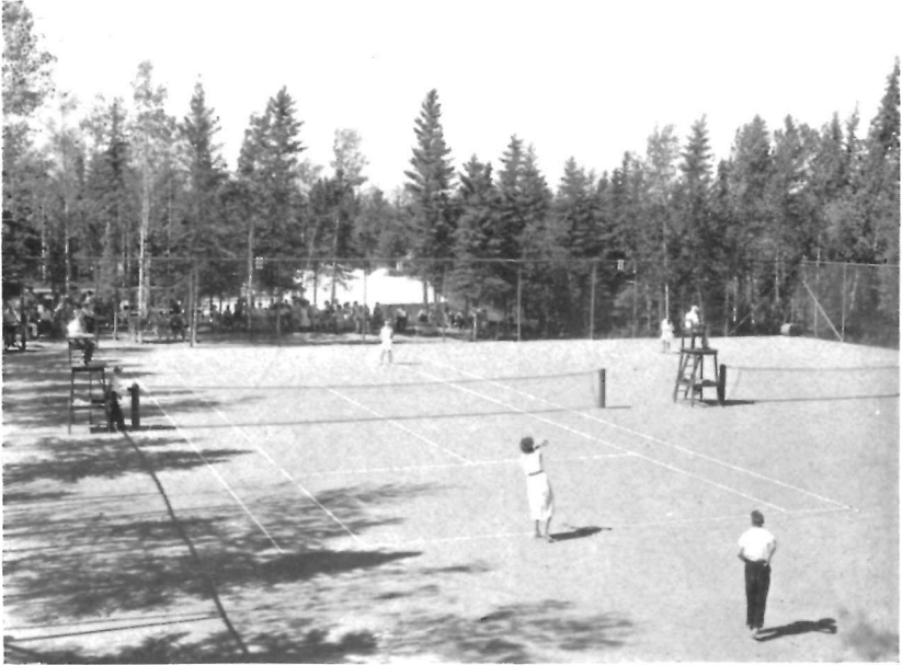
The Tennis Courts

Ten clay tennis courts are available for use without charge. Located in close proximity to the business subdivision and the motor campground, the courts are grouped in blocks of two, and rate with the finest in the province. A large recreation field, equipped with