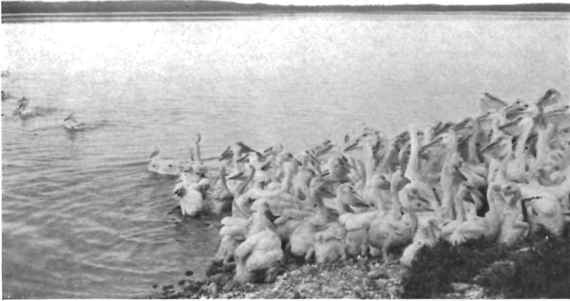
Young Pelicans at Lavallée Lake