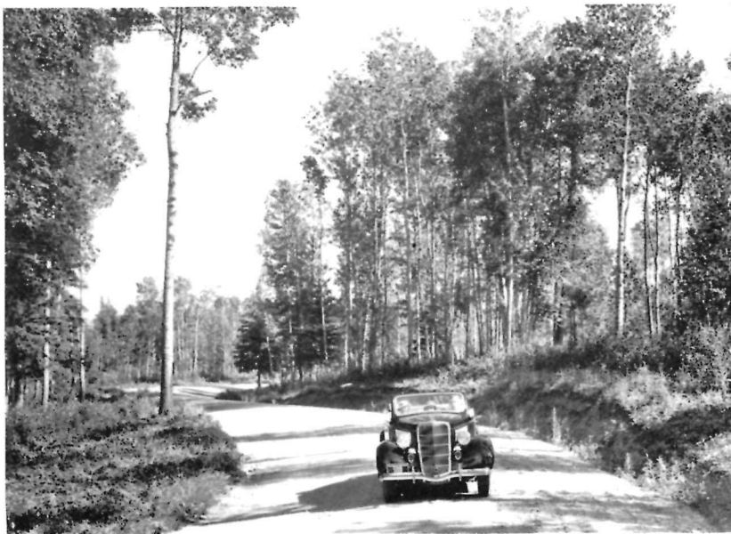
On the Park Highway

From Prince Albert an all-weather gravelled motor highway leads to the southeast corner of the national park where it connects with the Government road to lake Waskesiu, the most southerly