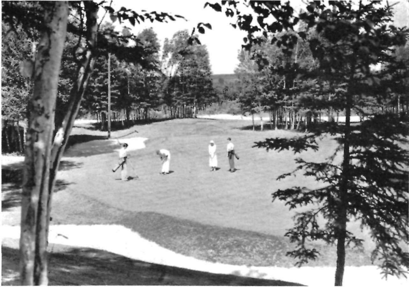
Holing Out on the 6th Green

A handsome club-house of peeled log and stone construction occupies an ideal site on an elevation surrounded by growths of spruce and birch, and commands a magnificent view of Wasquesiu