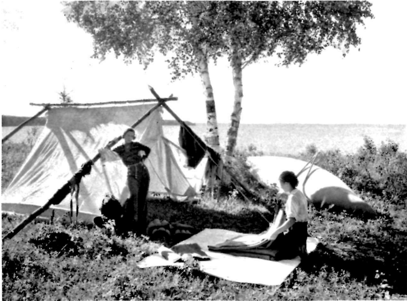
A Campsite on Lake Waskesiu

Heart lakes, themselves, are so closely connected that they form virtually one sheet of water, approximately eight miles long. Their high banks enclose numerous shady bays, green with lily pads, where moose come to feed and where the red deer loves to drink. It is an ideal feeding ground. Small poplars and aspens supply good browsing while the stillness of the water allows the slightest noise made by an enemy to be heard. A portage of about 500 yards connects the Hanging Heart lakes with Waskesiu lake, emerging at a point on its northeast shore almost opposite King island and approximately six miles from Waskesiu beach. A light railway has also been constructed