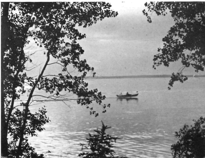
Boating at Twilight

The beauty of these northern lakes and rivers, the primeval freshness of the entire region, makes this reserve a much sought playground. To paddle for days by these uninhabited shores, far beyond the sound of motor car or railway, to travel through woods so solitary that even the breaking of a twig becomes exciting because it may mean the passing of an unseen wild animal, to make camp beside some clear flowing stream, to sleep under the stars—for nerves wearied by the increasing pressure and rush of modern civilization what holiday can be so sanative or medicinal! After a few days a man relaxes. The mental habits of the modern competitive life slip off like a garment. The ancient rhythms of trees and waters, the scent of pines, the smoke of the evening campfire, the wild cry of the loon, stir deep-buried ancestral memories, “felt in the blood and felt along the heart,” and evoke some peculiarly potent magic for the restoration