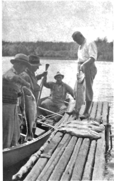
A Fine Catch of Lake Trout

Crean lake is connected with the Hanging Heart lakes by a narrow strait opening from its southwestern end. The Hanging