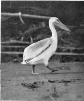
American White Pelican

The pelican is one of the quaintest of our northern birds, "relic of a twilight, antediluvian age." Its large melancholy eye, and its huge gullet pouch, which it uses as a kind of pantry for food for its young, give a semi-dignified, semi-humorous expression that is quite delightful. In flight, however, it becomes a thing of grace and beauty. Rising a little splashily from the water it beats the air for about a dozen times and then sails with outspread motionless wings on a long, easy glide.