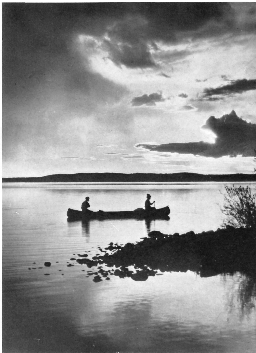
Sunset on Kingsmere Lake