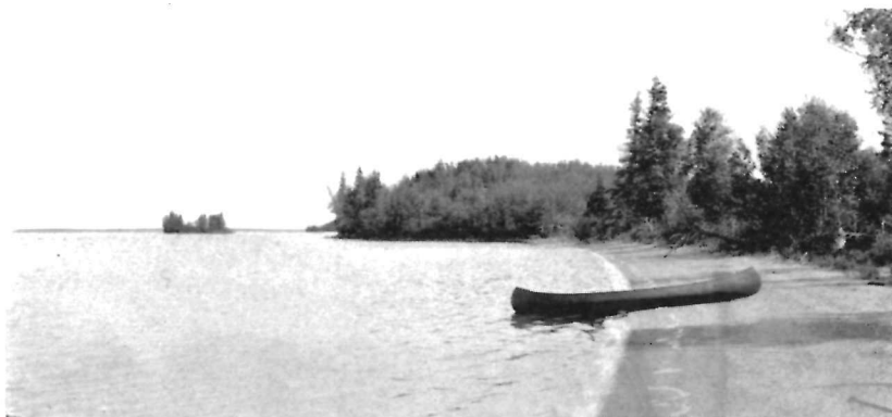
A Beach on Crean Lake