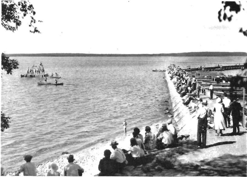
Regatta Day at Waskesiu