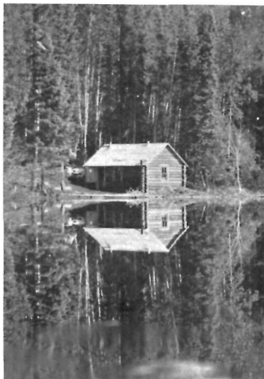
Reflections in Ajawaan Lake

These small lakes, with their green pellucid waters, and pure, almost well-like character, are generally much alike. All have deep basins, high heavily wooded banks and boulder-strewn shores. Ajawaan lake is about a mile long by a half a mile wide. Lone Island lake—so named because it possesses one small island—and Sanctuary lake are somewhat larger, perhaps two miles long by three-quarters of a mile wide. Their waters are almost always still so that they form perfect forest mirrors, their glassy surface reflecting in minute detail every leaf, twig and rock about their shores.