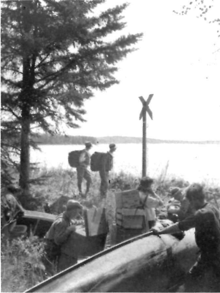
Ready for the Portage

scarring touch of fire, run out into bold rocky points built up by large boulders into a kind of rude masonry. Between lie white beaches of clear sand which offer ideal spots for bathing and camping. Among its proudest ornaments are several groves of white birch—one of the loveliest of all Canadian trees—which reach here a fine luxuriance. Their white boles, often from 18 to 20 inches through, gleam palely against the rich green of pine and spruce and when the lake is still, are reflected in double beauty on its calm surface. Fishing in this lake is, perhaps, the best in the park. Pike, pickerel and great Lake trout are all found in abundance.