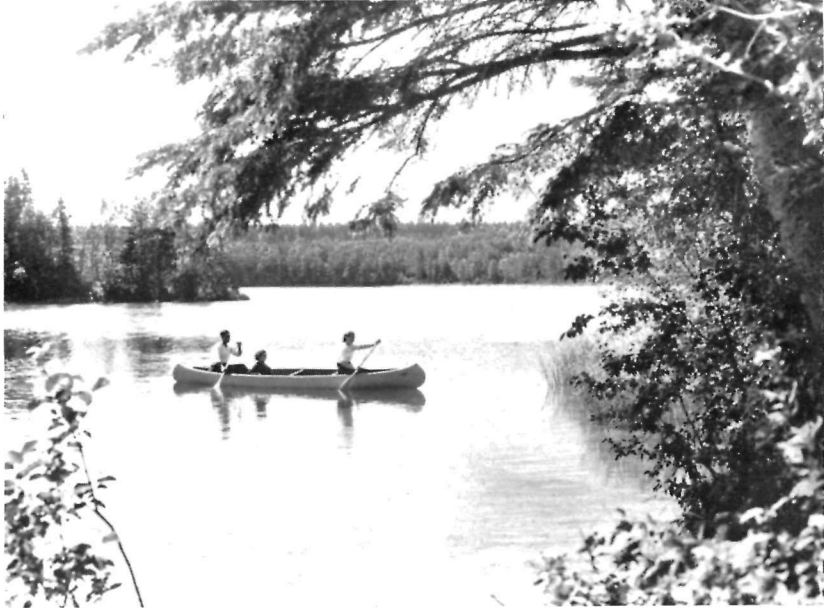
Padding Along Green Mantled Shores

supernatural beings in whom many of them still believe. The most popular hero of these legends is Wee-sa-ka-chack , the supernatural trickster, who has the power to assume any form or shape he chooses, and to change the appearance of any animal or bird. The tales relating to his exploits are so numerous that the old story tellers can relate one each night from autumn until spring without exhausting them all, and he still lives as vividly in the imagination of the Indians of today as he did in the minds of their ancestors hundreds of years ago.