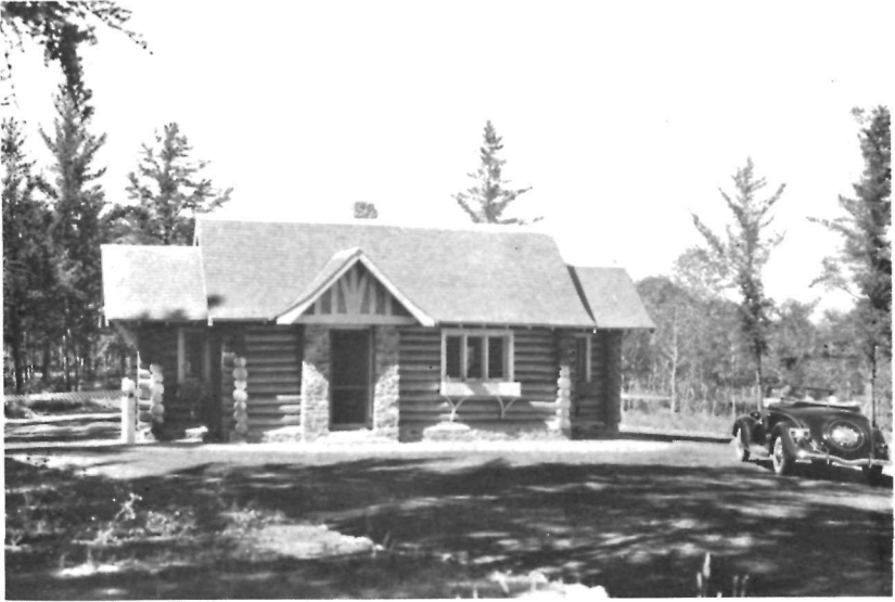
The Park Registration Building

of the large lakes in the park. The distance from the city of Prince Albert to the Park boundary is thirty-six miles, and from the Park boundary to lake Waskesiu thirty-three miles.