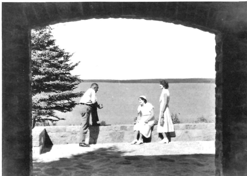
Lake Waskesiu from the Golf Club Terrace

And what a picture it is! Stretching away like a great uncut crystal for twenty miles, its waters coloured with the hues of heaven, its shores a rich unbroken green. Far out in the lake, like a green frigate riding at anchor, lies King island, rising high above the water and completely covered with pines. The south shores of the lake are low, broken by little capes with small bays and sandy beaches, but on the north they rise often from fifty to one hundred feet.