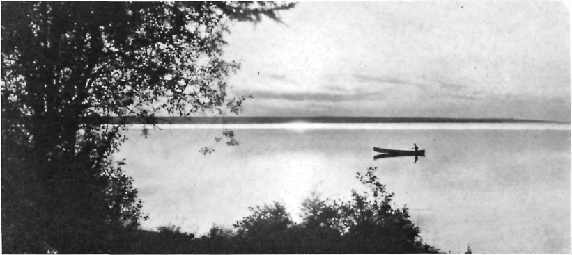
Sundown on Lake Waskesiu

The southern boundary of the park lies about thirty-six miles north by west of the city of Prince Albert. Its western boundary is formed in part by the Sturgeon river, its eastern by the Third Meridian. At about the 54th parallel, however, the park limits swing eastward, so as to touch but not include the waters of Montreal lake.