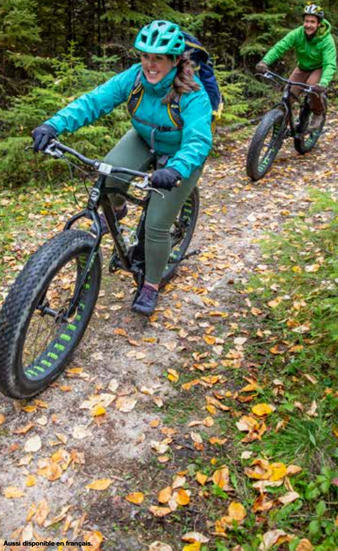
Aussi disponible en français.