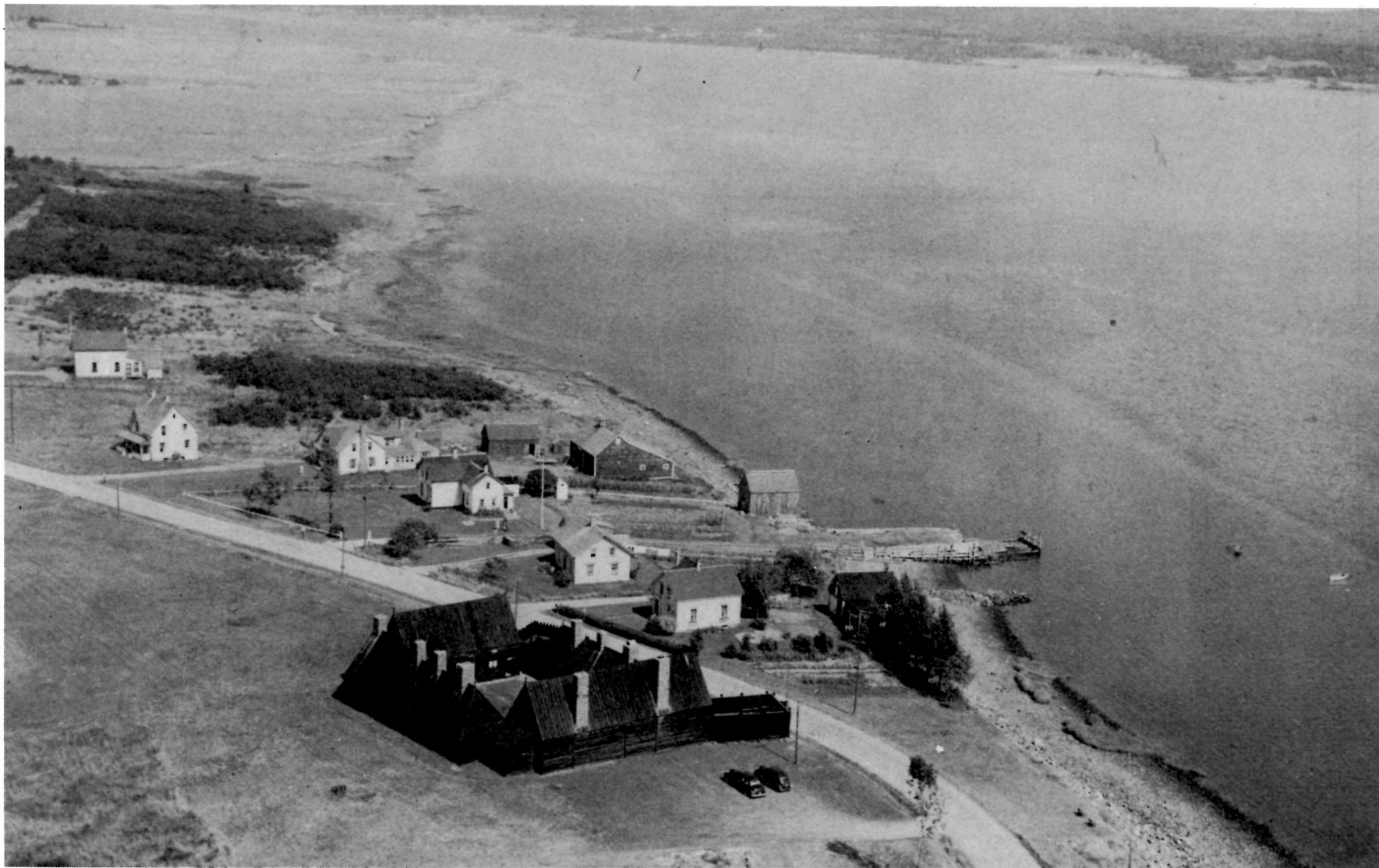
Port Royal Habitation, Annapolis Basin