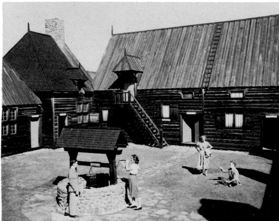
The Courtyard, Port Royal Habitation

A WISE NATION PRESERVES ITS RECORDS - - - GATHERS UP ITS MUNIMENTS - - - DECORATES THE TOMBS OF ITS ILLUS- TRIOUS DEAD - - - REPAIRS ITS GREAT PUBLIC STRUCTURES AND FOSTERS NA- TIONAL PRIDE AND LOVE OF COUNTRY BY PERPETUAL REFERENCE TO THE SACRIFICES AND GLORIES OF THE PAST.