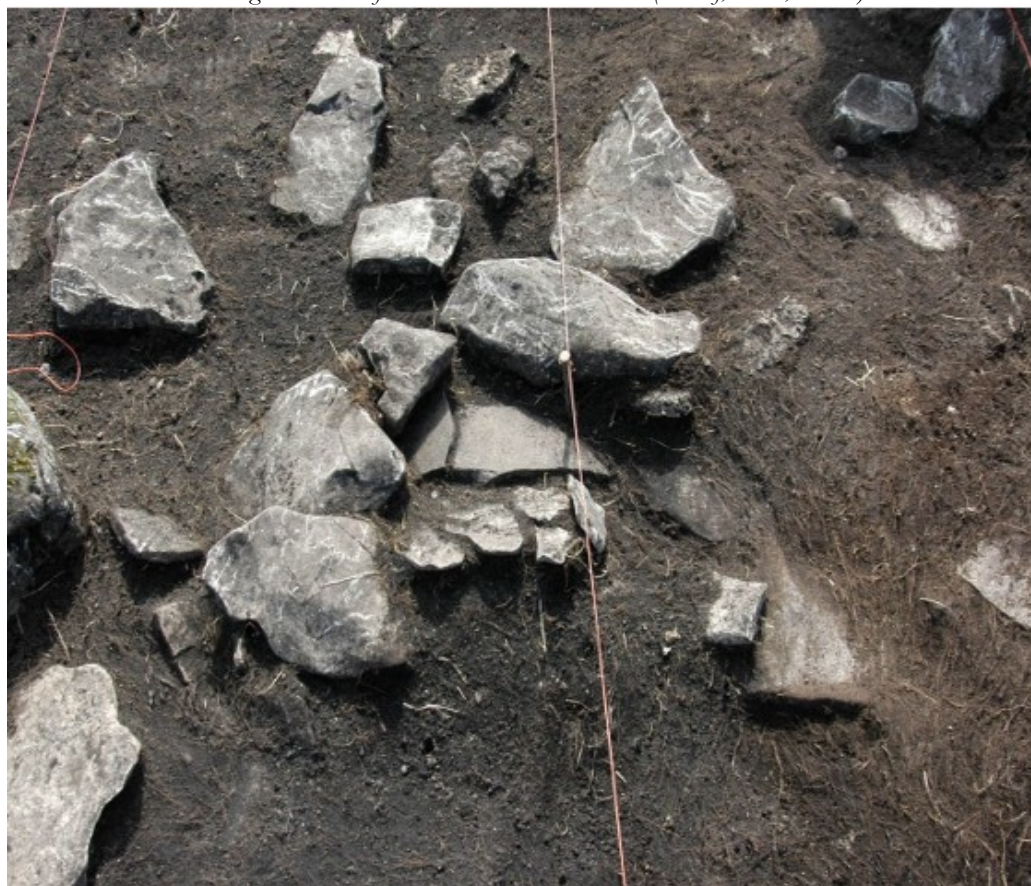
Figure 4 Axial feature. Nails at 1 m intervals (Renouf, Wells, Lavers)