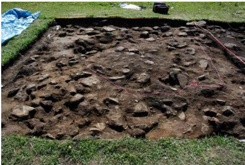
Figure 3 Gravel platform outlined with pink string (Renouf, Wells, Lavers)