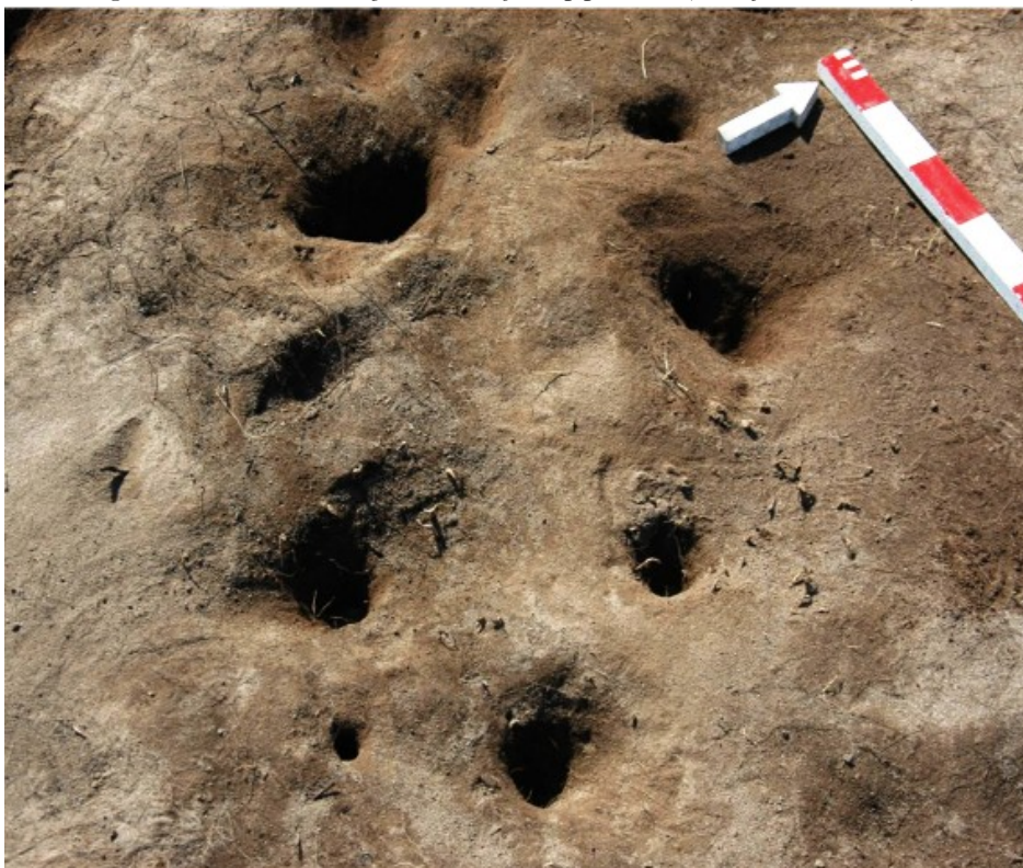
Figure 6 Oval area outlined by medium-sized, deep post-holes (Renouf, Wells, Lavers)