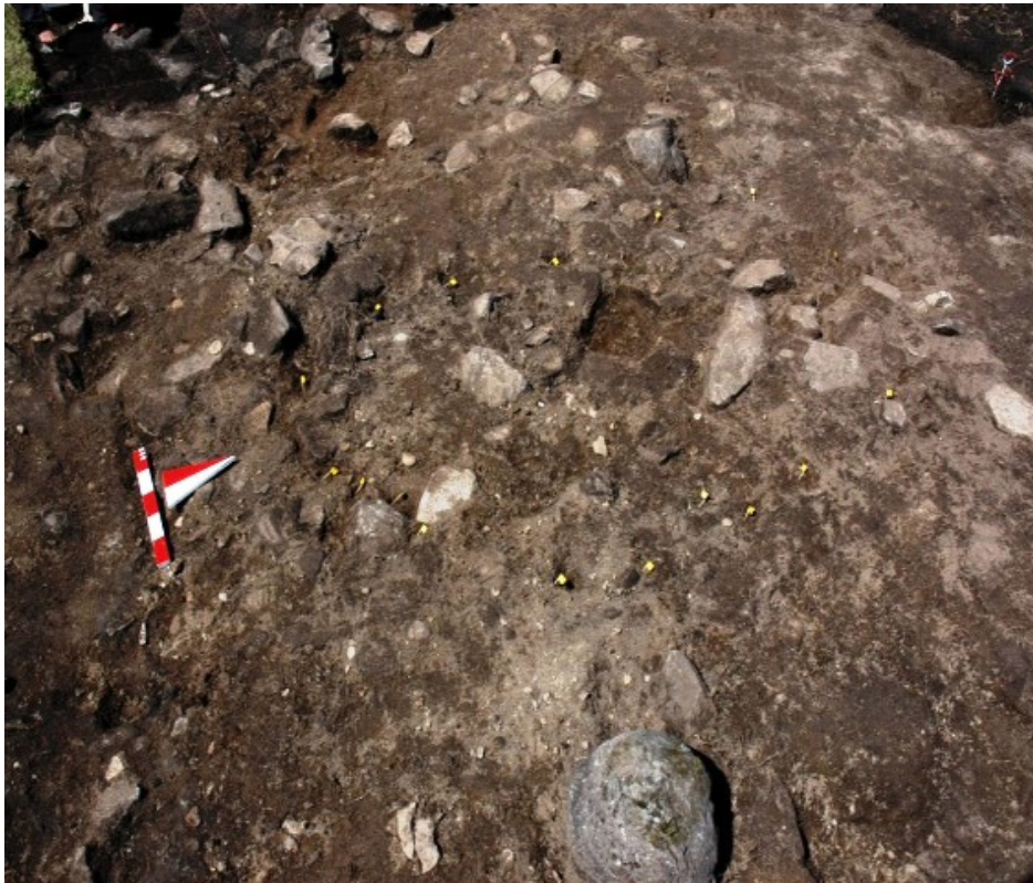
Figure 5 Oval area outlined by shallow stakeholes; each is flagged with yellow (Renouf, Wells, Lavers)