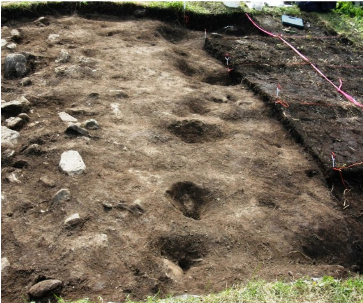
Figure 7 Line of large, shallow post-holes at terrace edge (Renouf)

2009 2008 field season at Phillip's Garden, Port au Choix National Historic Site . Report to the Provincial Archaeology Office, Department of Tourism, Culture and Recreation, Government of Newfoundland and Labrador.