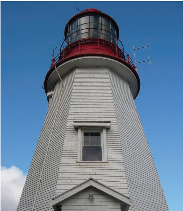
Pacific Rim National Park Reserve of Canada

Today, backpackers know the trail as the West Coast Trail and come to see the beauty, experience the challenges, and walk the path of those that came before them. However, this rugged hike is not for everyone.