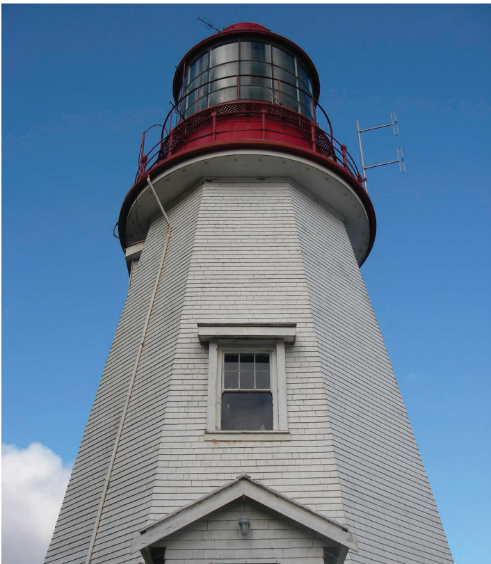
Pacific Rim National Park Reserve of Canada

Today, backpackers know the trail as the West Coast Trail and come to see the beauty, experience the challenges, and walk the path of those that came before them. However, this rugged hike is not for everyone.