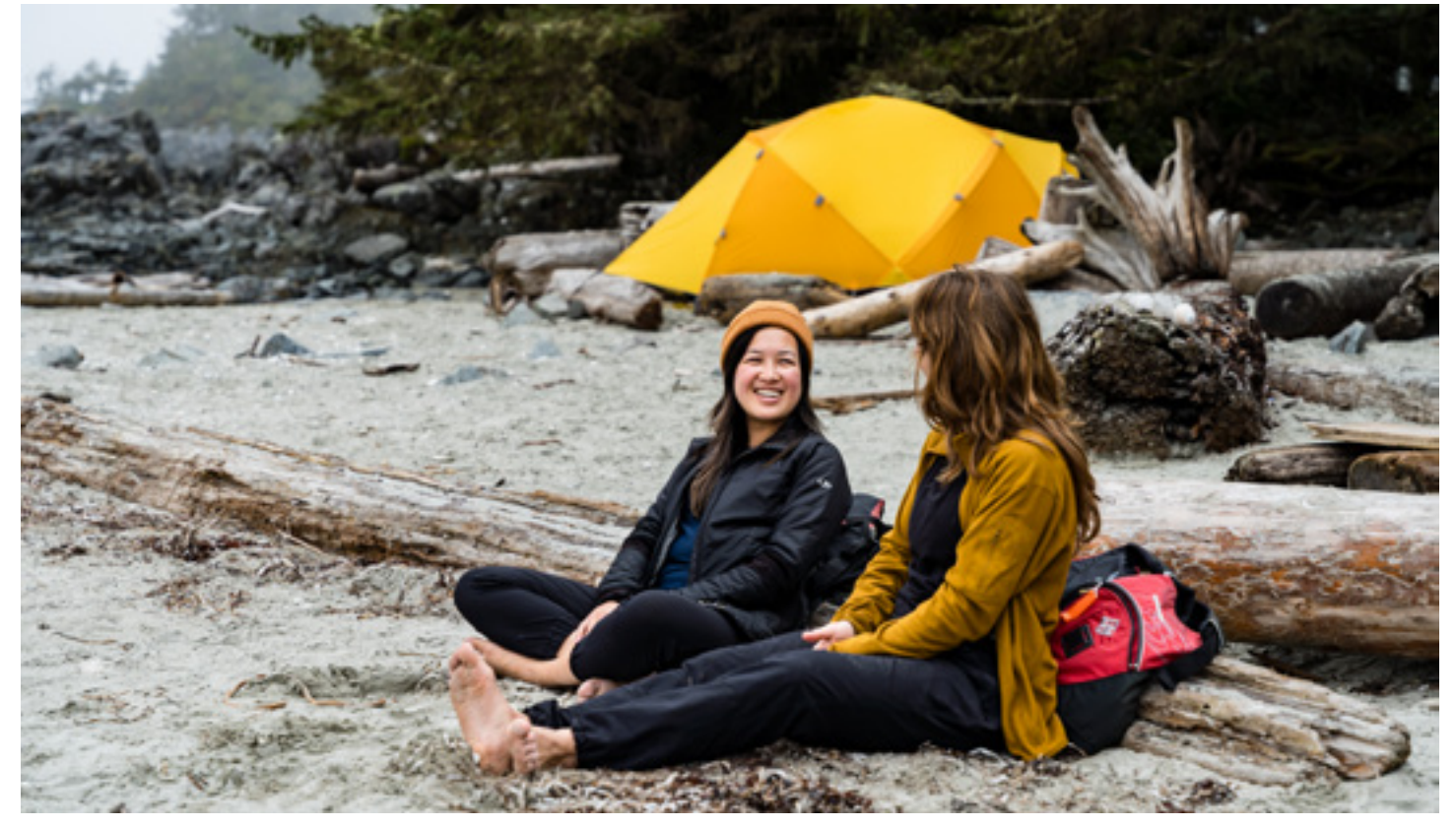
Pacific Rim National Park Reserve of Canada - Broken Group Islands Paddler's Preparation Guide 2025