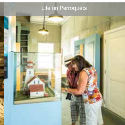
Life on Perroquets