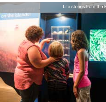
Life stories from the Mingan Islands