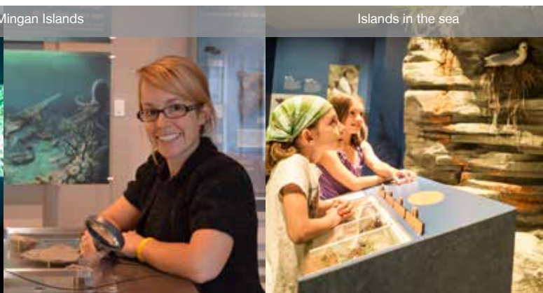
Islands in the sea