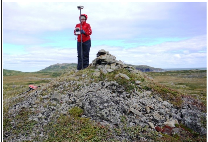
Figure 2 Photograph of rover antenna (Leica GS09 GNSS) with hand held unit (CS09 Controller).

Primary funding for this project is through the Competitiveness in a Changing Climate program of Natural Resources Canada and the Department of Environment and Conservation, Government of Newfoundland and Labrador. To follow progress of the CARRA project you can visit our web site at www.carra-nl.com .