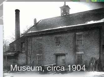
Museum, circa 1904