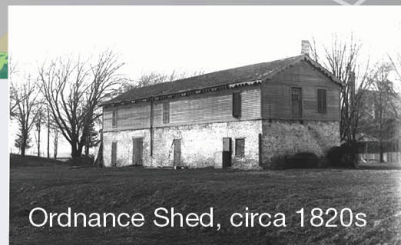
Ordnance Shed, circa 1820s