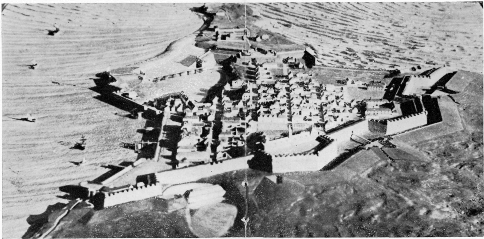
MODEL OF THE FORTRESS OF LOUISBOURG