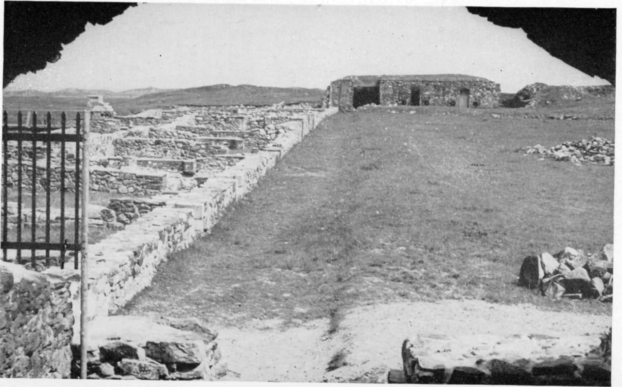
OLD "BOMB-PROOF SHELTERS" AMID RUINS OF FORTRESS OF LOUISBOURG