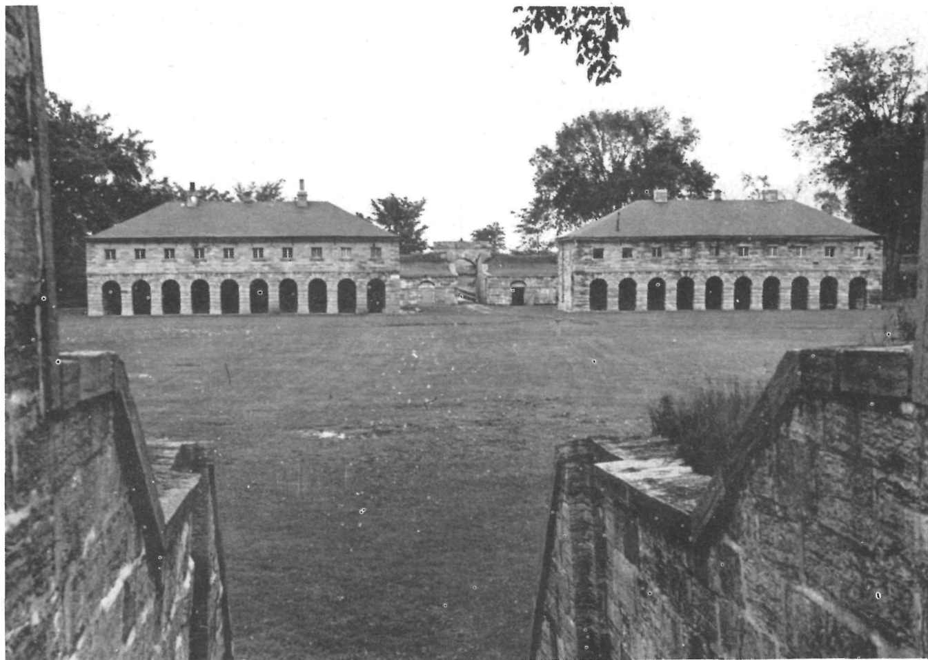
Fort Lennox National Historic Park