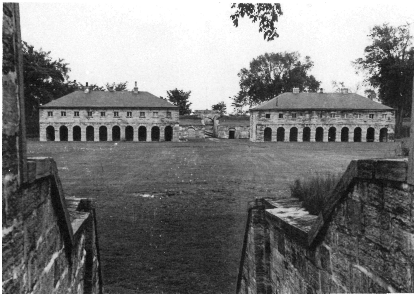
Fort Lennox National Historic Park