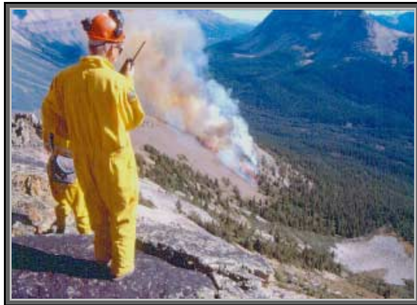
Figure 6: Field staff carrying out a prescribed burn (Helen Ridge) in the upper Bow Valley, Banff National Park.

This site was burned in 1998 and under the original design, is scheduled for a re-measurement in 2003. Because there are limited funds available for whitebark pine research, a balance must be achieved between the need to monitor previous burns such as the Helen Ridge site and the need for additional sites. Money has already been spent on the layout of three additional sites in the mountain parks, but these have yet to be burned. Continued agency support is needed so that these sites can be burned before the time and effort put into the layout and initial assessment is lost.