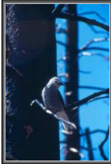
Figure 3. Juvenile Clark's nutcracker in a recent prescribed burn.

Similarly, whitebark pine has adaptations that accommodate seed dispersal by Clark's nutcrackers. The nutrient rich seeds of whitebark pine are wingless and remain in the cone after maturity. Cones are found on the tips of upswept branches, rather than close in to the core of the tree. This presentation allows the cones to be more easily seen by the passing birds (Lanner 1996). While the whitebark pine cones are still attached to the tree's branches, Clark's nutcrackers adeptly harvest the seeds by ripping open the cones with their long pointed beaks (Tomback 1978).