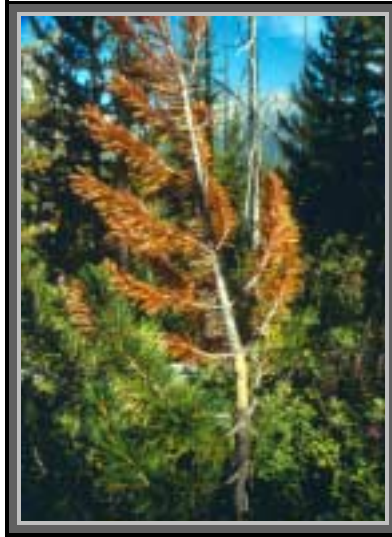
Figure 5: Girdling of a sapling at a blister rust canker.