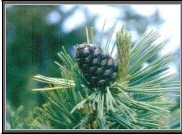
Figure 4. A female whitebark pine cone.

Whitebark pine produces masts of seeds every 3 to 5 years (Morgan and Bunting 1992) with intervening years having very low, or no seed production. In the years with low seed production, nutcrackers have been known to erupt from their usual habitat and travel great distances in search of other food sources (Fisher and Myres 1979). One such event was documented in 1976 when nutcrackers appeared in the Cypress Hills of Southern Alberta, over 300 km from their usual habitat (Fisher 1979, Fisher and Myres 1979). Although Clark's nutcrackers depend heavily on whitebark pine seeds as a food source, the relationship between whitebark pine and this bird species is mutualistic (Tomback 1982). Without seed caching by nutcrackers, practically no whitebark pine regeneration would occur. The few seeds that remain in the cones eventually drop to the ground and, if rodents do not forage them on, they rot before they germinate (Hutchins and Lanner 1982). Lanner (1996) points to the heavy wingless seeds as evidence of the co-evolution of the bird-pine relationship because wind is no longer an effective method of seed dispersal.