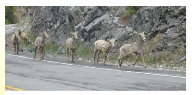
Two rams and a ewe in Redstreak in February.

The majority of sheep mortalities from motor vehicle collisions occur between November and February near the Radium Village. Although there have been fewer highway sheep mortalities recorded this year than usual, this decline cannot be attributed to the new signs.