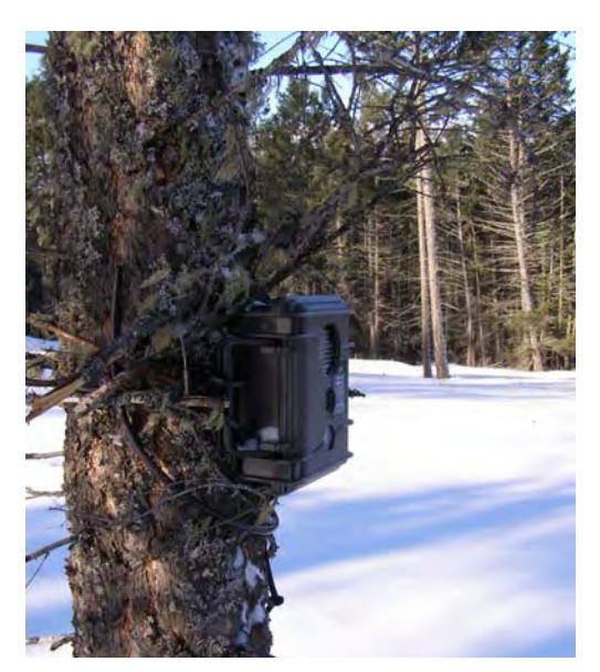
A remote digital camera set up in the Redstreak restoration area.

Four new flashing Bighorn sheep signs have been erected on Hwy # 95 through the town of Radium Hot Springs. A silhouetted image of a Bighorn ram on a bright yellow sign equipped with flashing LED lights alert motorists to the possibility of sheep on the highway. Traffic is slowing down and staying more alert!