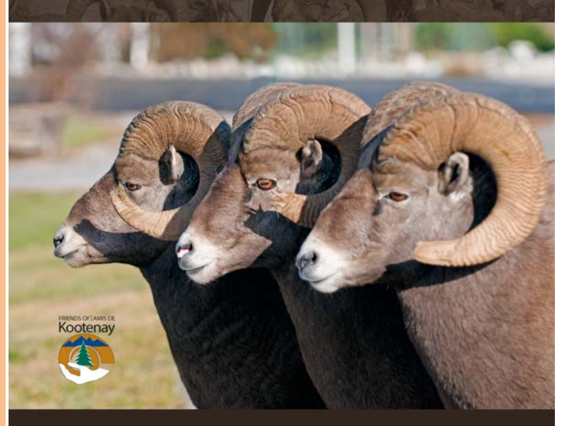
The Bighorns of Radium Hot Springs