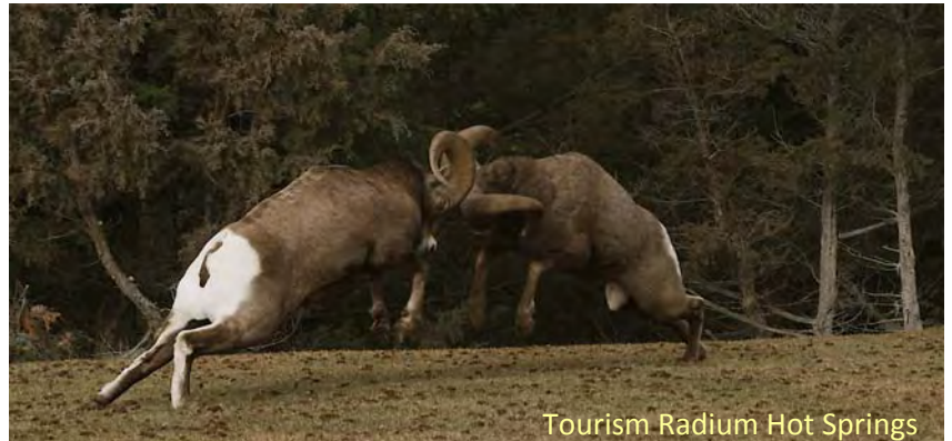
Tourism Radium Hot Springs

If you would like to be removed from our membership list email us at: friendsofkootenay@gmail.com