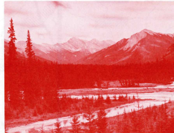
Evergreen forests fill the Simpson River Valley and clothe its slopes to treeline.

Evergreen forests clothe the mountains and valleys. The vegetation of the Park is luxuriant and