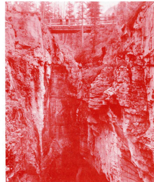
For thousands of years this stream has been eroding the walls of Marble Canyon.

Only a few of the wildflowers will be mentioned. They are all gems when found singly or in masses blanketing a mountain slope or alpine meadow. Even their names promise visual pleasure—mariposa lily, purple clematis, dwarf Canadian primrose, western anemone, white globe-flower, balsam-root, avalanche or snow lily, yellow mountain-avens, alpine saxifrage, butterwort and Venus'-slipper orchid.