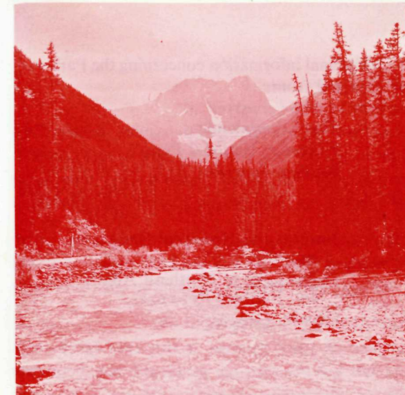
Numa Creek Valley—from Marble Canyon.