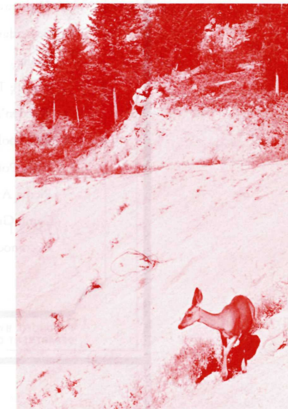
A young mule deer picks its way down a slope.

Campfires may be kindled only in fireplaces provided for this purpose and must be completely extinguished before campers leave the site. Visitors observing an unattended fire should attempt to extinguish it if possible and promptly report it to the nearest Park employee. Fire in a National Park can cause damage that cannot be repaired in a hundred years.