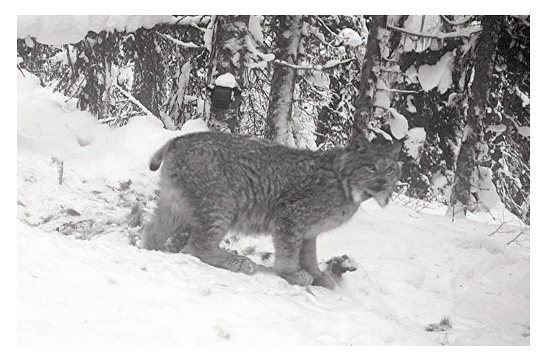
FIGURE 2. Remote camera photo of a Canada Lynx at the carcass of a Mule Deer it killed in the southern Canadian Rocky Mountains, January 1999.