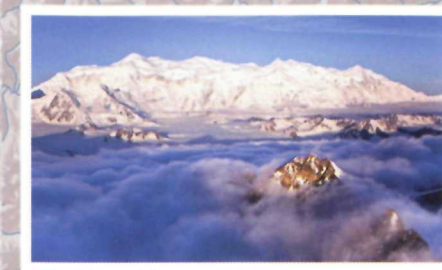
1 Mount Logan Canada's highest mountain