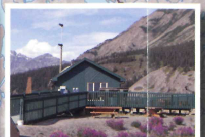
2 Thachàl Dhàl Visitor Centre