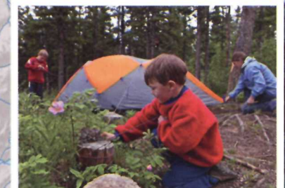
4 Kathleen Lake Campground