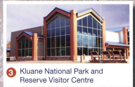
3 Kluane National Park and Reserve Visitor Centre