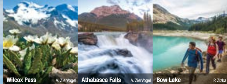
Wilcox Pass Athabasca Falls Bow Lake