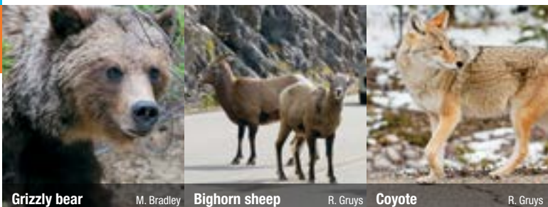
Grizzly bear Bighorn sheep Coyote

Bow Lake, the source of the Bow River, is one of the more scenic and accessible lakes for fishing.