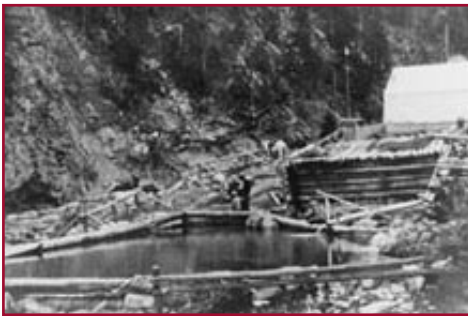
Miette circa 1935

of the Rockies' springs. The crude pool eventually became a million dollar facility with two hot pools and one cool bathing pool.