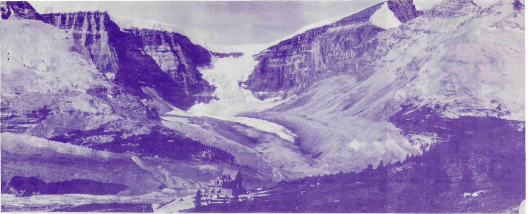
Gripping the sheer slopes of the surrounding mountains, the Dome Glacier is easily accessible from the Columbia Ice-field Chalet lying below.