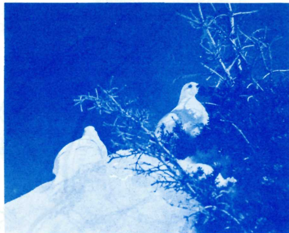
White-tailed ptarmigan in winter dress.

Hawks, woodpeckers, ptarmigan, warblers, and grouse are but a few of the many other birds which are frequently seen.