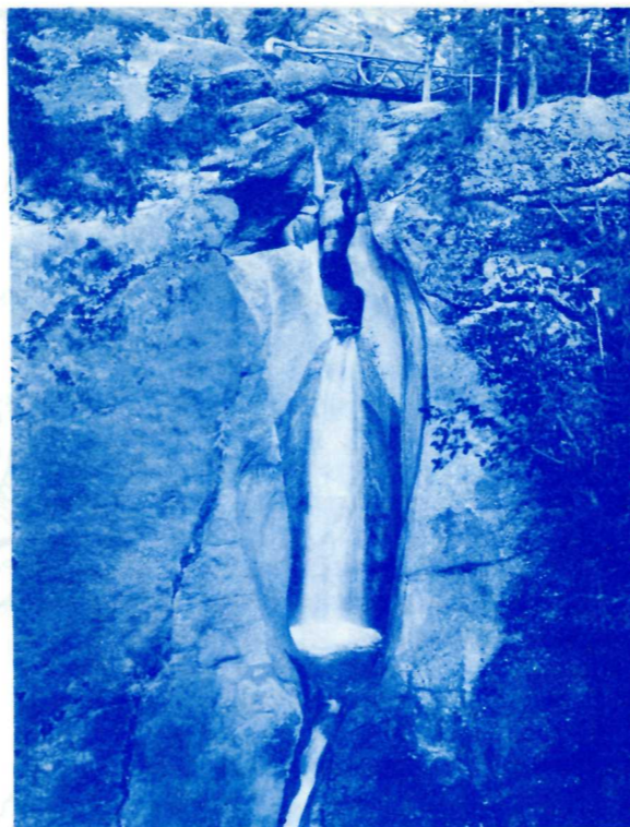
Glacial waters carve their way through solid rock at Punch Bowl Falls.

The great movements within the earth's crust which have formed the mountains of Jasper National Park have exposed rocks ranging in age from the most ancient to the most recent. Some of the rocks were laid down in the earliest defined era in the history of this planet, the Precambrian. At this time in earth's history the lands were naked of vegetation and in the seas there lived only a very few primitive invertebrates and algae. Many of the mountains in the Park display great thicknesses of rocks which were laid down in the next era, the Palaeozoic. This was a time of rapid development of living things with plants spreading over the lands and a vast increase in animal life. Fishes swarmed in the seas and the reptiles had appeared. A third major chapter in