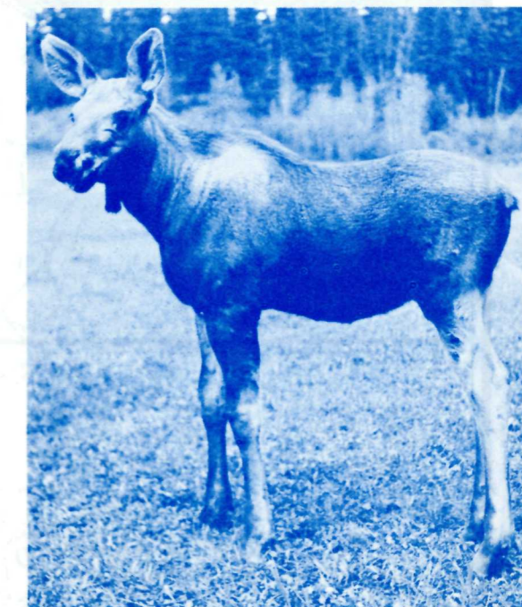
A young cow moose in sanctuary.

Some of the more common shrubs found in the Park are wild rose, buffaloberry, willow, alder, juniper, shrubby cinquefoil, silverberry, Saskatoon berry, Labrador tea, red osier dogwood, and two kinds of bearberry.