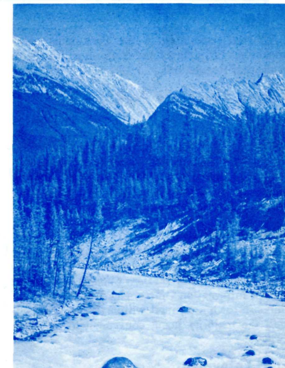
A variety of evergreens clothe the mountain slopes to tree line.

Boating is a popular pastime in the Park, although visitors may operate motor-boats only on Pyramid and Medicine Lakes. Boat trips on Medicine and Maligne Lakes are offered by private interests.