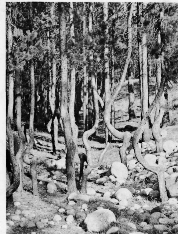
These vigorous young pines—although badly bent—survived the force of an avalanche.

Boating is a popular pastime in the Park, although visitors may operate motor-boats only on Pyramid and Medicine Lakes. Boat trips on Medicine and Maligne Lakes are offered by private interests.