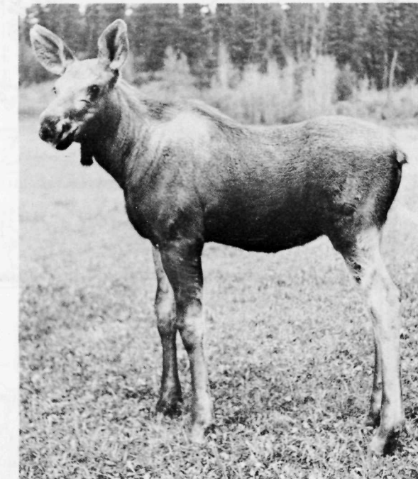
A young cow moose in sanctuary.

Some of the more common shrubs found in the Park are wild rose, buffaloberry, willow, alder, juniper, shrubby cinquefoil, silverberry, Saskatoon berry, Labrador tea, red osier dogwood, and two kinds of bearberry.