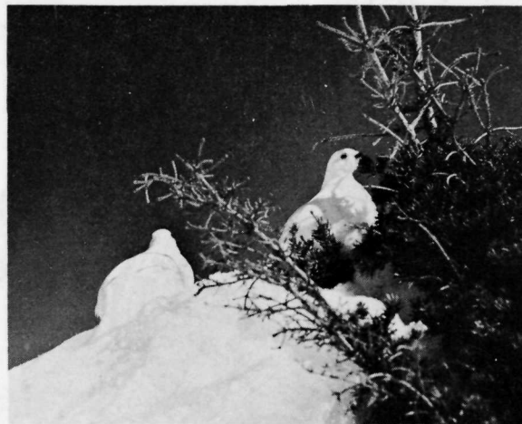
White-tailed ptarmigan in winter dress.

Hawks, woodpeckers, ptarmigan, warblers, and grouse are but a few of the many other birds which are frequently seen.