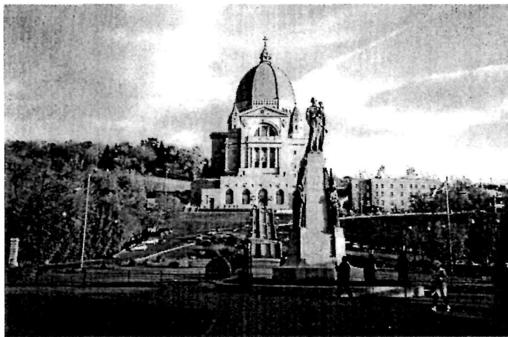
Saint Joseph's Oratory of Mount Royal, Montréal, Quebec