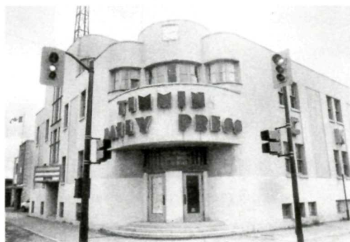
Thomson Building, Timmins, Ontario -- demolished 1995 --

whose commemorative integrity has been destroyed