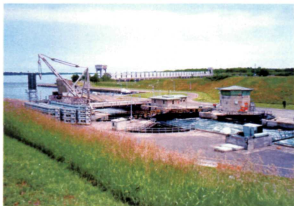
Construction of the St. Lawrence Seaway