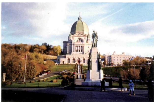
Saint Joseph's Oratory of Mount Royal, Montréal, Quebec