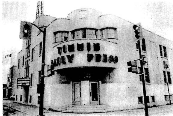
Thomson Building, Timmins, Ontario -- demolished 1995 --

whose commemorative integrity has been destroyed