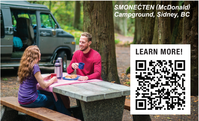
SMONEĆTEN (McDonald) Campground, Sidney, BC

Come and visit SMONEĆTEN, near the Town of Sidney, British Columbia. Stroll through the dense lush forest or enjoy a weekend stay at the drive-in campground from May 15 to September 30.