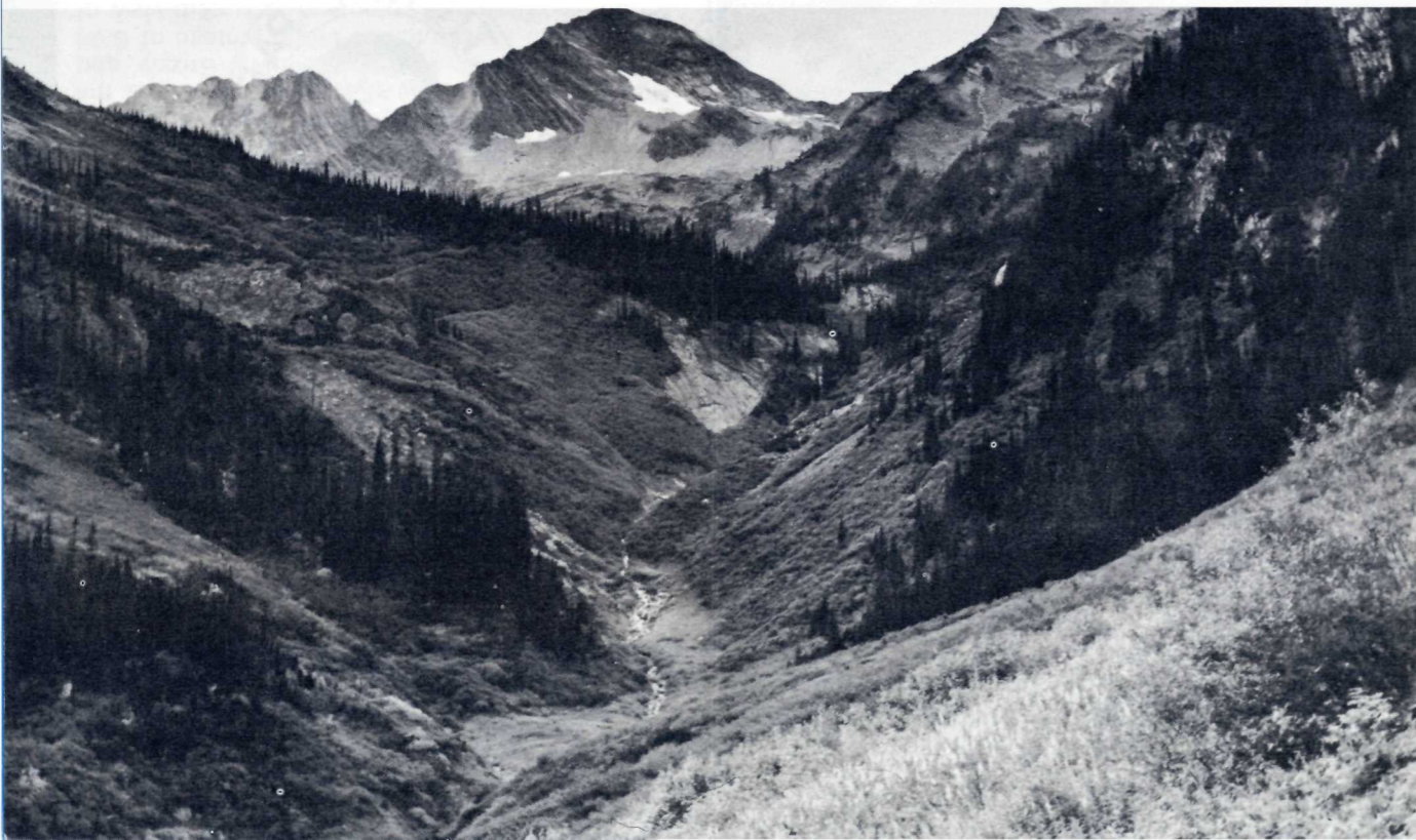
Cougar Valley and Mount Bagheera.

In 1962, the completion of the Golden-Revelstoke section of the Trans-Canada forged the final link in a transcontinental highway spanning Canada from St. John's, Newfoundland, to Victoria, B.C. A memorial to this achievement was unveiled on Sept. 3, 1962, by Rt. Hon. John Diefenbaker, the Prime Minister of Canada, and is a popular stopping place for tourists, passing through the park.