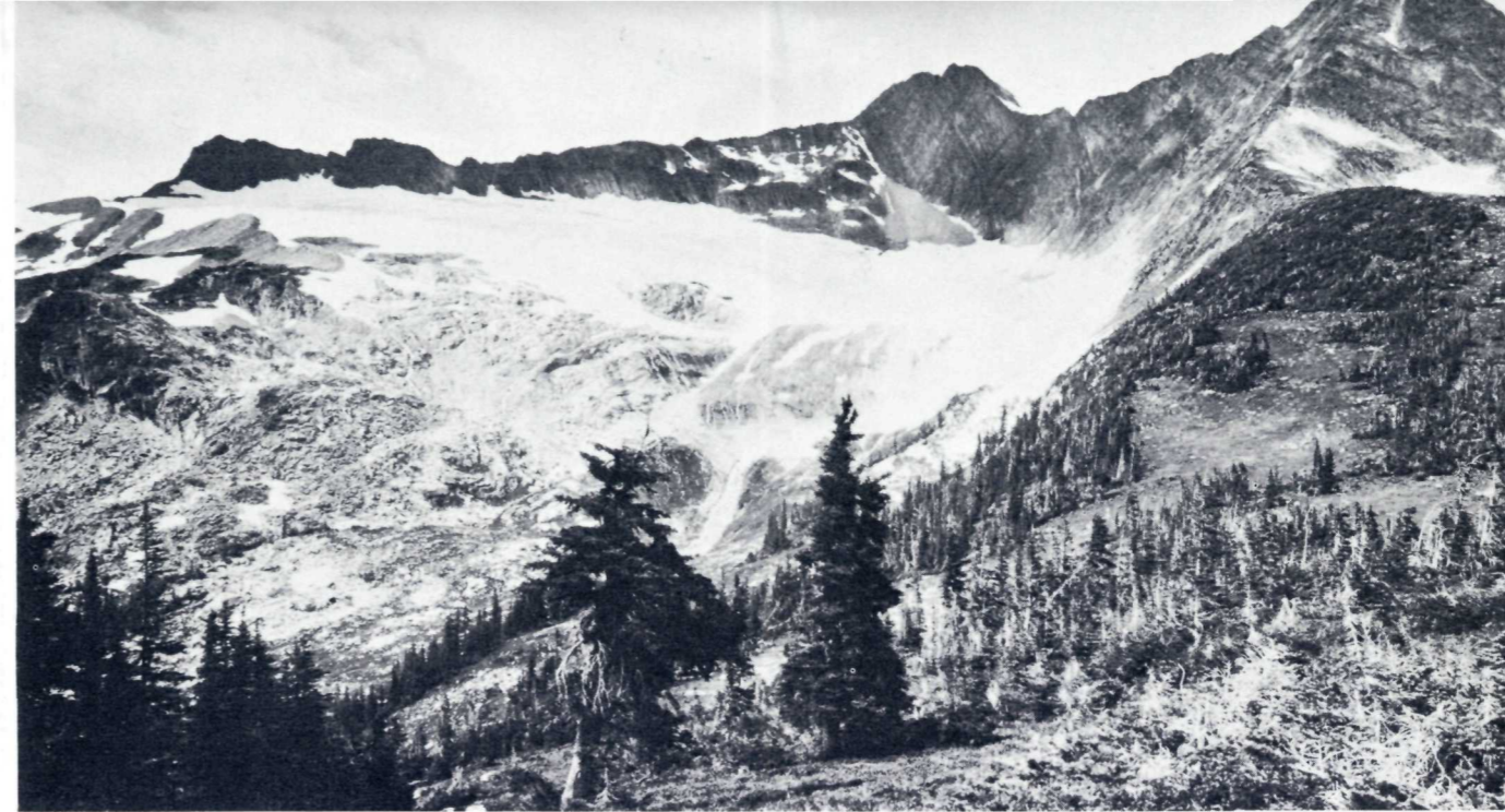
Mount Catamount and its glacier are seen from the top of Baloo Pass.

There are 74 avalanche paths threatening the Trans-Canada Highway in Glacier National Park. As you drive through the park, you will pass through six concrete snowsheds which protect the