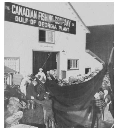
Workers bring in a large seine net at the Gulf of Georgia Cannery in the 1940's. CFC 3-18-6